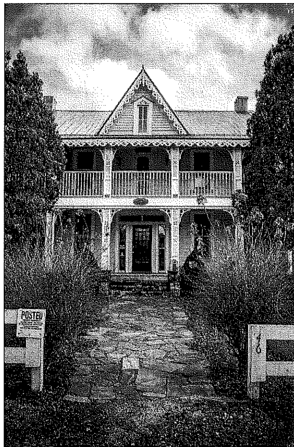
"The Linville River Farm bed and breakfast, no longer in operation,"

Billy thanked him and picked up his suitcase and set out to walk the quarter-mile to The Bell and Dragon. He had never been to Bath before. He didn't know anyone who lived there. But Mr Greenslade at the Head Office in London had told him it was a splendid city. "Find your own lodgings," he had said, "and then go along and report to the Branch Manager as soon as you've got yourself settled."