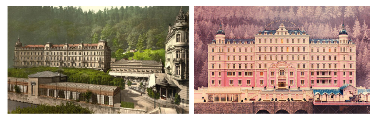
Left: Twentieth Century Fox Film Corporation; courtesy of the Library of Congress Photochrom Print Collection Right: Wes Anderson's 'The Grand Budapest Hotel', 2014

Fall 2017 ARC500 M002 T TH 11:00-12:20pm SLOC 325 Nicole McIntosh l nmcintos@syr.edu www.architectureoffice.org