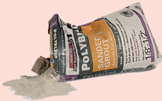
Cement & Grout