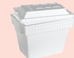
Foam / Polystyrene