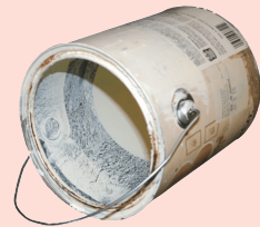
Empty Paint Cans

These materials are accepted at the CENTER FOR HARD TO RECYCLE MATERIALS (CHaRM) , not the Hazardous Materials Management Facility.