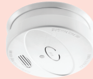
Smoke & Carbon Monoxide Detector