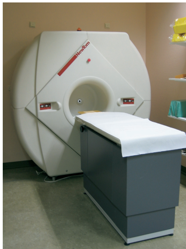
FIGURE 1. Digital volume tomography with the NewTom QR DVT 9000.

DVT imaging was performed with the NewTom QR DVT 9000 (Fig 1), which is designed particularly for imaging of the head. During imaging, the x-ray tube and the detector rotate 360° around the fixed headrest. An image is taken within every degree of rotation. The detector is composed of an image amplifier with an 8 × 8-inch window and an amplification of 22:1. A charge-coupled device (CCD) with a matrix of