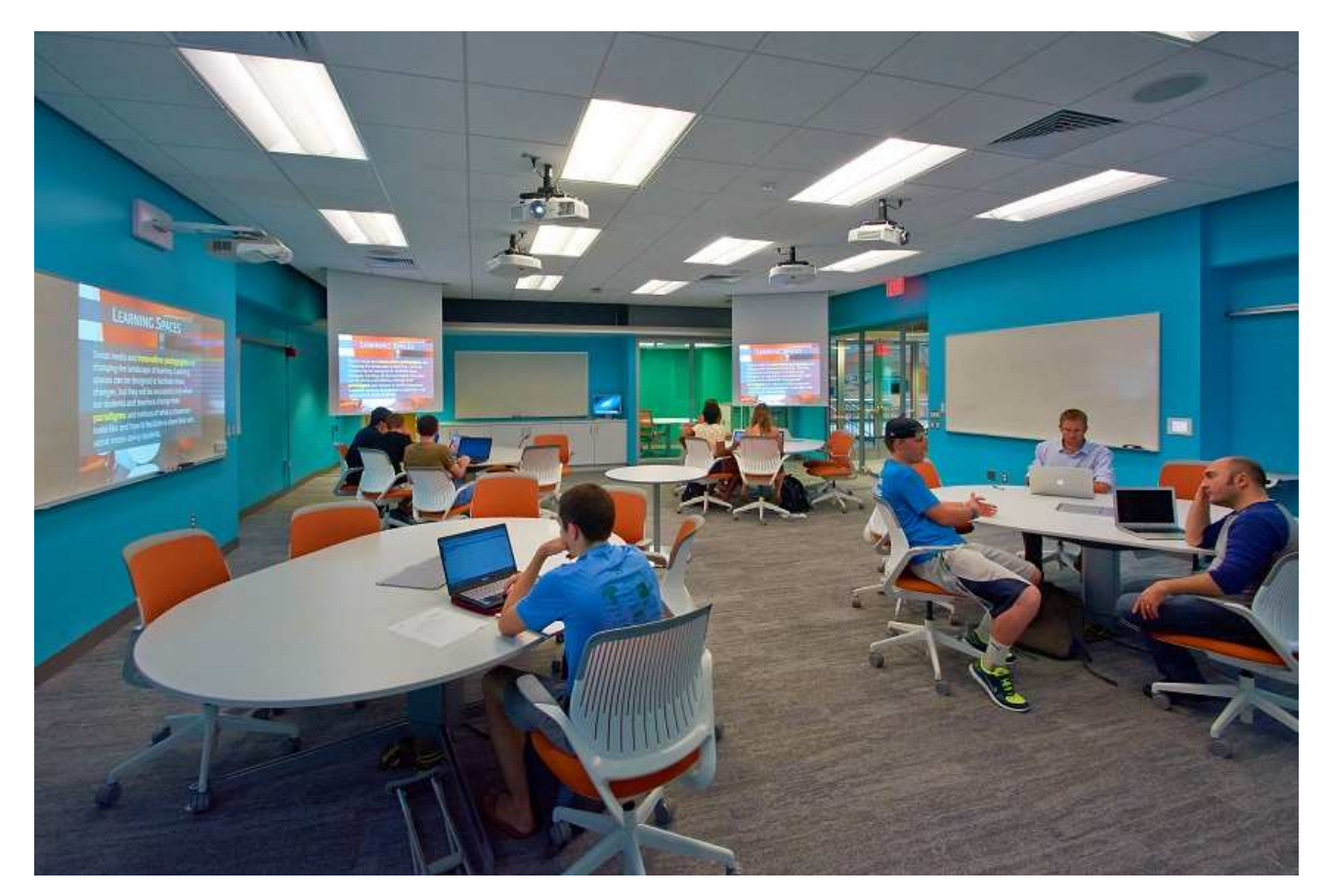
Figure 3. The Learn Lab classroom.

and the Sales Representative did not make any decisions, only recommendations, during the design of the Krause Innovation Studio so the decision to exclude them from participation was made.