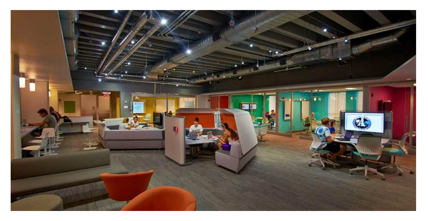
Figure 2. The Main Studio Space in the Krause Innovation Studio.