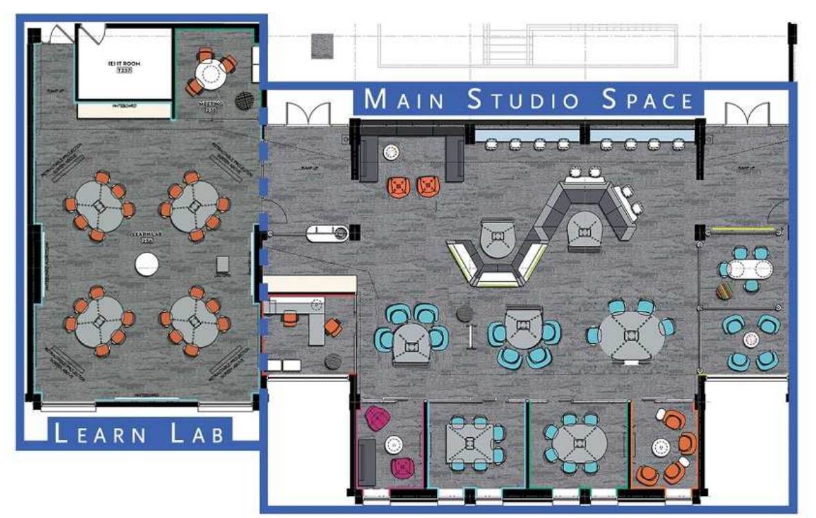
Figure 1. The two Krause Innovation Studio spaces: the Learn Lab and the main Studio space.

The main Studio space (displayed in Figure 2) features a welcome area and working bar with individual seating, five semi-private collaborative pods in the middle of the space, one open room/space, one staff office, and four private rooms. The welcome area and working bar serve as a parking area while students or staff members wait for other areas in the space to open. The five semi-private pods feature Steelcase's media:scape®1 tables and a large 42" display. The media:scape® design includes a console in the center of the table, which offers 6 electrical outlets and 4-6 video graphics array (VGA) connections to the local display. The students can connect individual devices to the system and toggle between display devices using one-touch control pucks. Two of the four private rooms offer media:scape® connections to a set of two 32" displays. In these rooms, two students can display individual devices simultaneously side-by-side.