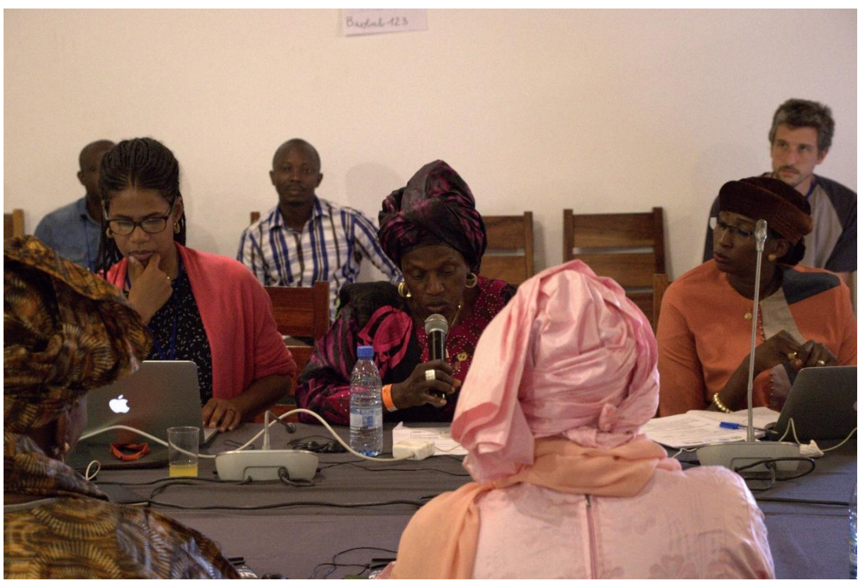
Photo: Parliamentarians and researchers at AMMA-2050 meeting June 2019 discussing the key results from AMMA-2050 research (Source: Beth Mckay, FCFA/CCKE).