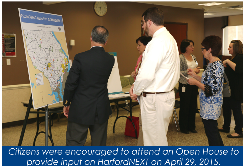
Citizens were encouraged to attend an Open House to provide input on HarfordNEXT on April 29, 2015.

The Department simultaneously launched a HarfordNEXT webpage that provided information on the master plan process, status of the update, and links to reference material. A link was also provided to a cloud-based online civic engagement platform known as Open Town Hall. This platform allowed for an unprecedented level of community outreach. Citizens were able to access Open Town Hall anywhere from a computer or mobile device. The forum was updated periodically with questions to engage the public on a wide range of topics. Citizens could also forward their comments directly to the Department via an email link on the webpage.