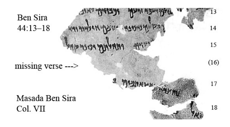
Rabbinic reactions to the exaltation and immortality of Enoch

This removal of Enoch from the ranks of the righteous may be subsequently explained in the early rabbinic period following the fall of Jerusalem and Masada. Early rabbinic sources including Bereshith Rabba and Pesikta de Rav Kahana present a radically divergent perspective on Enoch's life. This view appears to reflect a period of inner sectarian polemics between the rabbinic academies and other religious groups, especially the Enochites, whose religious practice was guided by revelation that was not received "from Moses at Sinai." For the rabbis, the Enoch of Gen 5:24 is not understood to provide a paradigm of righteousness and wisdom for fellow members to emulate. Rather, he is presented as a model of failure and betrayal, which leaves no room for his redemption. Bereshith Rabba 25:1 presents the judgments of two sages who deny that Enoch's righteousness even earned him a place in the Book of Life. For them, in fact, the opposite was true. He vacillates between righteous and wicked deeds and so is removed from the roster of the righteous and is added instead to the roster of the wicked. The following quotes are from Bereshit Rabba 25:1: