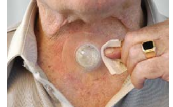
Use of a Remove wipe on top of a FlexiDerm adhesive to help with adhesive removal

Provox® and Provox® XtraBase® are protected by patents, patents pending and design patents and design patents pending. Provox® and Provox® XtraBase® are registered trademarks owned by Atos Medical AB, Sweden. Provox® FlexiDerm™, Provox® OptiDerm™, and Provox® Regular™ are trademarks owned by Atos Medical AB, Sweden. Remove™ and Skin-Prep™ are trademarks owned by Smith & Nephew Inc.