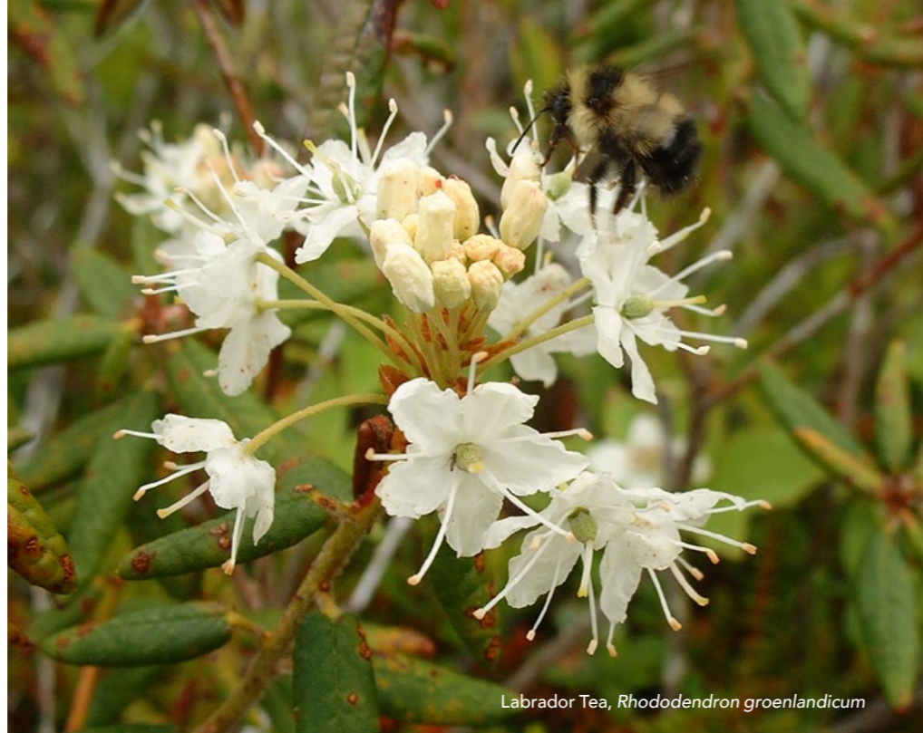
Labrador Tea, Rhododendron groenlandicum