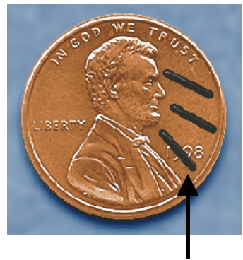
Size of Seed Implant