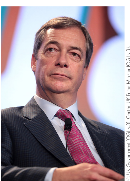
Left: Prime Minister Theresa May (in office July 2016-July 2019). Center: Prime Minister Boris Johnson (in office July 2019-present). Right: Nigel Farage, leader of the Brexit Party.

11 to October 14, 2019. Many citizens and members of Parliament saw this as a powerful move to suppress democracy. They voiced concern that Parliament would not have enough time to review and debate any new Brexit agreements Johnson negotiated with the EU before the October 31 deadline.