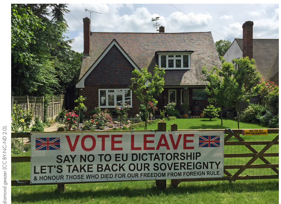
Epping, England, United Kingdom, June 2016.