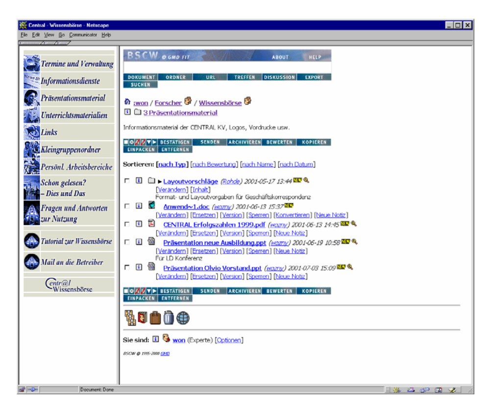
Figure 2: The Knowledge-Exchange System of GEHICO (screenshot will be in English in final version)