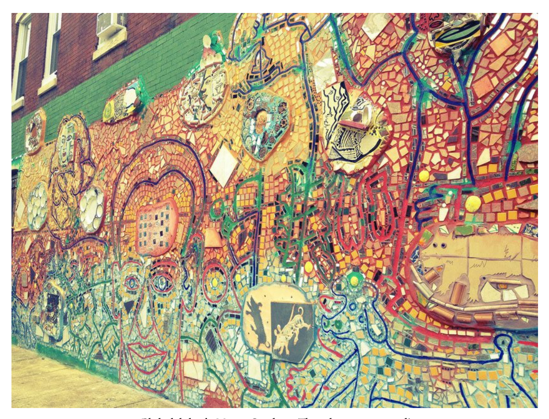
Philadelphia's Magic Gardens. This place was so cool!