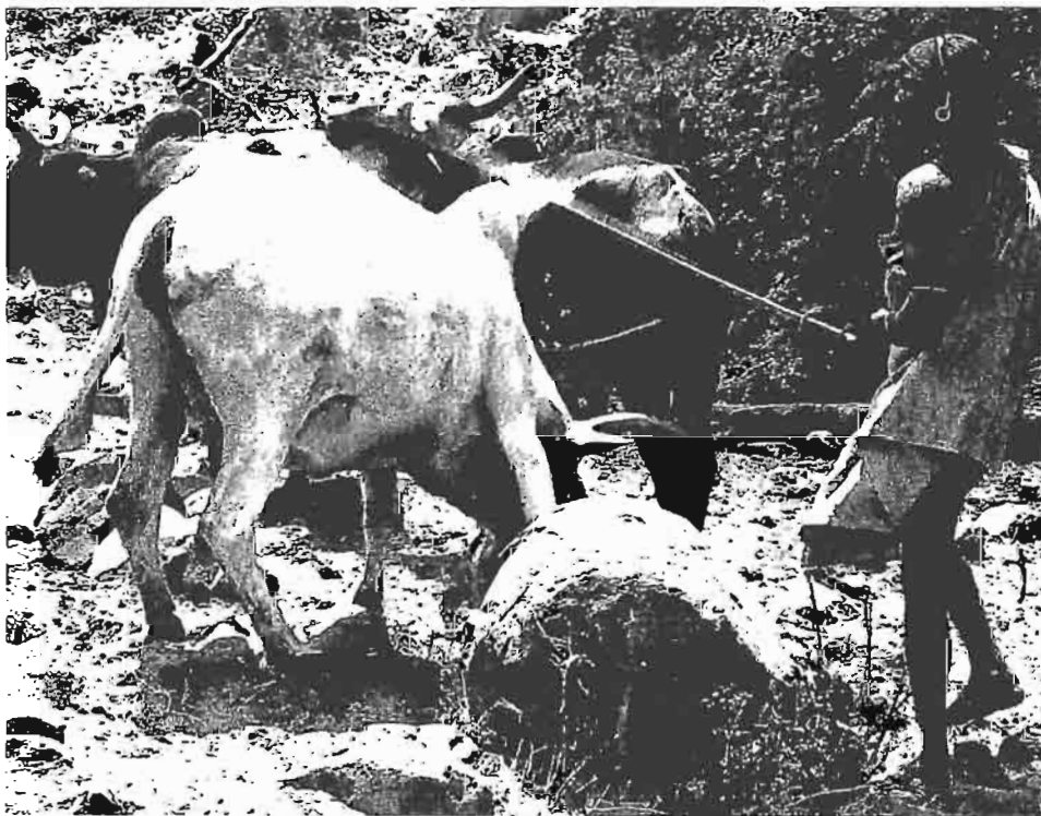
FIGURE 2.— Samburu warrior herding cattle.

Diet, anatomy, and pollution. —As cattle pastoralists Samburu and Maasai believe God gave them cattle and small stock to provide them with milk, meat, and blood (see Figure 2). To eat animal foods from outside this domain risks both natural and mystical misfortune. "Unclean" foods include most wild animals - fish, birds, eggs, reptiles, and non-ruminant mammals including pigs, carnivores, and rodents. Only those wild animals that resemble domestic livestock in their diet and behavior such as giraffe (considered an archaic "camel"), antelope ("small stock") and eland ("cattle") are considered edible, and they are only eaten during periods of severe shortages and famine.