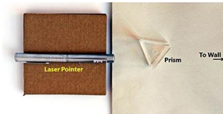
Figure 8. Photograph showing experimental setup for measuring the index of refraction of a liquid. The prism is a few centimeters in front of the laser pointer. The laser pointer is pointing perpendicular to a nearby wall.