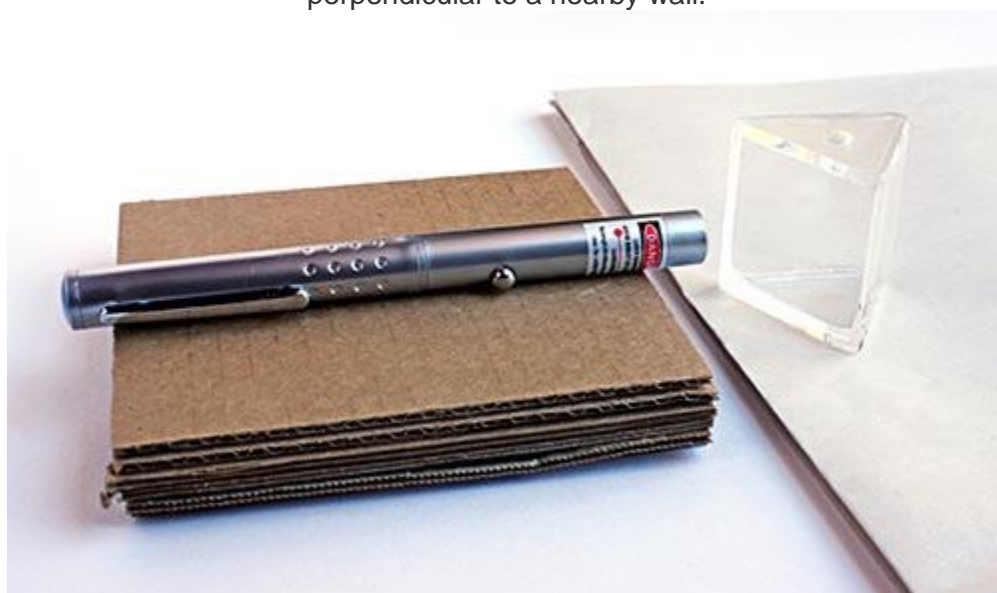
Figure 9. Adjust the height of the laser pointer with pieces of cardboard. The beam of the laser should hit the prism about halfway up the prism's side.