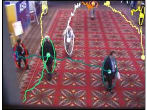
Video analytics software tracks people or objects, and can alarm on types of behavior

CCTV cameras are an important security component at office buildings, in hallways and parking areas. With an integrated approach, when an employee contacts security, lights and surveillance cameras can be activated to monitor the scene to observe the emergency, and officers can pinpoint where to intervene to thwart an attack.