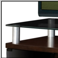
Elevated glass top