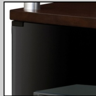
Smoked glass cabinet doors