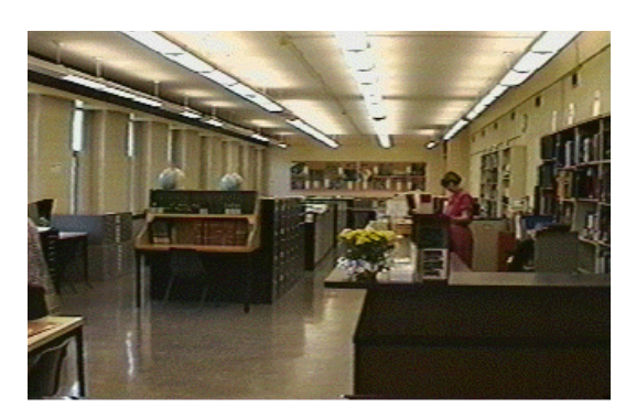
Figure 3: UMD Library

Thursday from 8:30 a.m. to 8:30 p.m., Friday from 8:30 a.m. to 4:30 p.m., Saturday from 1 p.m. to 5 p.m., and Sunday from 1 p.m. to 6 p.m..