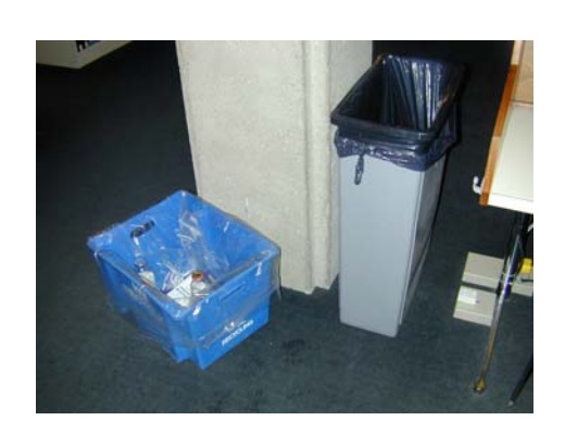
Davis Centre: Blue box