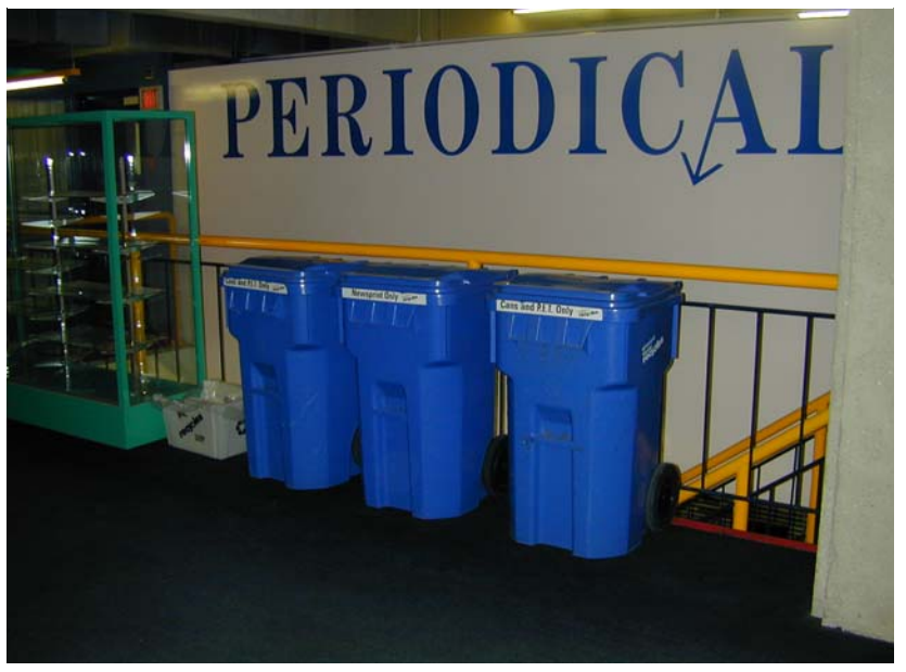
Figure 4: Recycling containers with signs at the Davis Centre

bins with signs on or above them proved to be contaminated during the 2002 audit. Less than half (48%) of the bins without a sign proved to have no contamination; 56% of the bins without a sign were observed to be contaminated. Due to the prevalence of contamination in bins with signs and bins without signs, it is not possible,