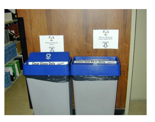
Dana Porter: Tall Bins for Recycling