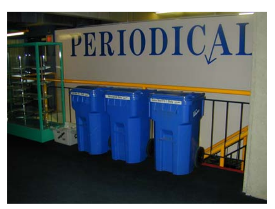
Davis Centre: White box for recycling white paper (far left) Blue Carts for: Glass, Cans & PET, newsprint