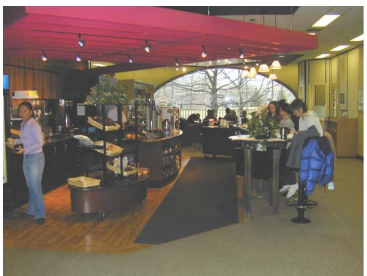
Figure 8. Dana Porter's Browser's Cafe

Since the DP library decided to change its eating and drinking policy, one of the sources that can attribute to contamination of waste & recycling containers is the recently opened Browser's Cafe on the main floor (see Figure 8).