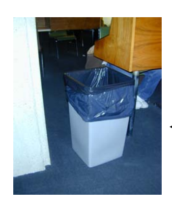
Tall bin (two different shapes)