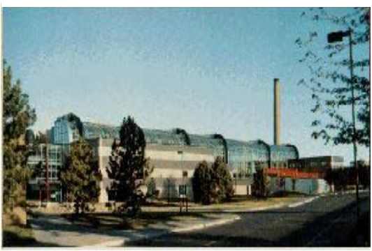
Figure 2: Davis Centre Library

library is open to students Monday to Friday from 8 a.m. until midnight, and from 11 a.m. until midnight during the weekend. During examination period at the end of each academic term, the library extends its operating time by three hours during the week and by four hours during the weekend.