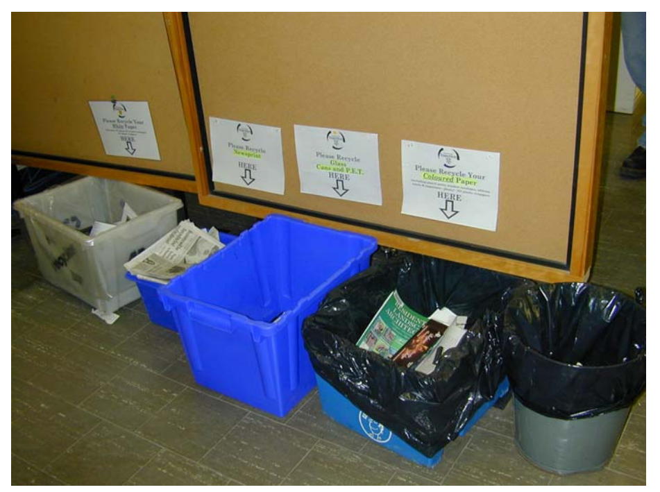
Figure 9. Waste Disposal bins in UMD

garbage container capacity use or contamination was observed during either audit; however, it should be noted that both audits took place during non-exam times and thus, exam-time waste disposal could reveal different trends.