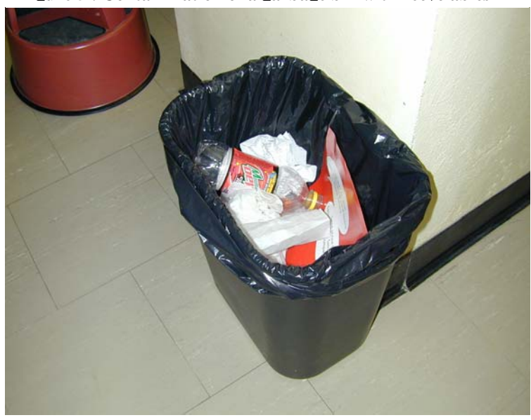
Figure 5: Contamination of a garbage bin with recyclables

It was observed that the capacity of the bin used decreased an average of 5% from the first audit to the second audit, supporting the theory that waste generation in the library is significantly higher during exam periods. Furthermore, of the bins that were observed to be the same type (i.e. recycling or garbage) and in the same location during both surveys, an increase of 0.8% in