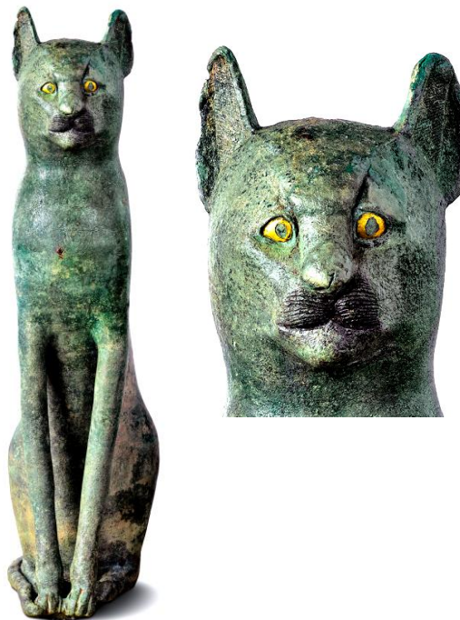
Figure6. Casted bronze cat statue from the 22 nd Dynasty [19].