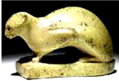
Figure2. Faience crouching cat from the 17 th Dynasty [16].