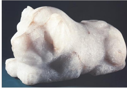
Figure18. Quartz lion from the Early Dynastic [30].