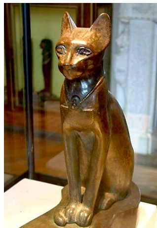
Figure9. Casted bronze cat from the 26 th Dynasty [21].

The designer showed the cat wearing a thick blue pectoral and setting her tail beside her right side.