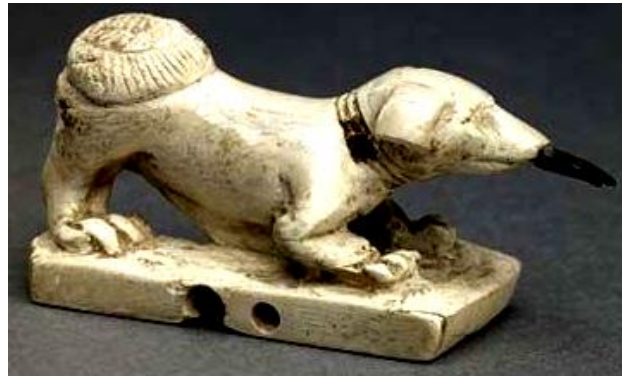
Figure16. Bronze dog from Late 18 th Dynasty [28].