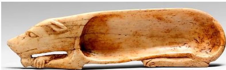
Figure14. Bone dog spoon from the 18 th Dynasty [26].