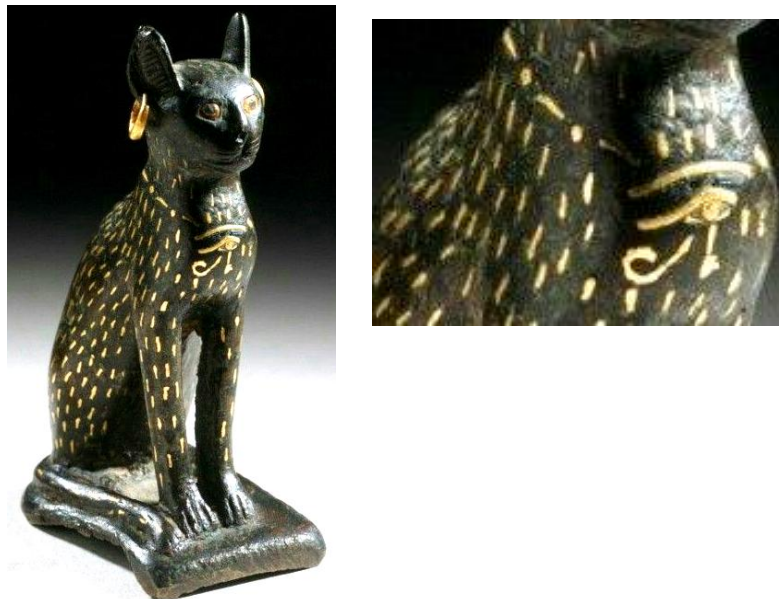
Figure4. Bronze cat figurine from the 21 st -26 th Dynasties [18].