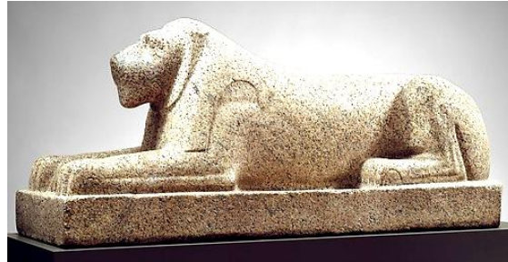
Figure19. Granite lion from the 4 th -5 th Dynastic [31].