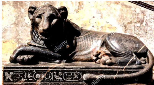
Figure23. Granite lion from the 30 th Dynasty [36].