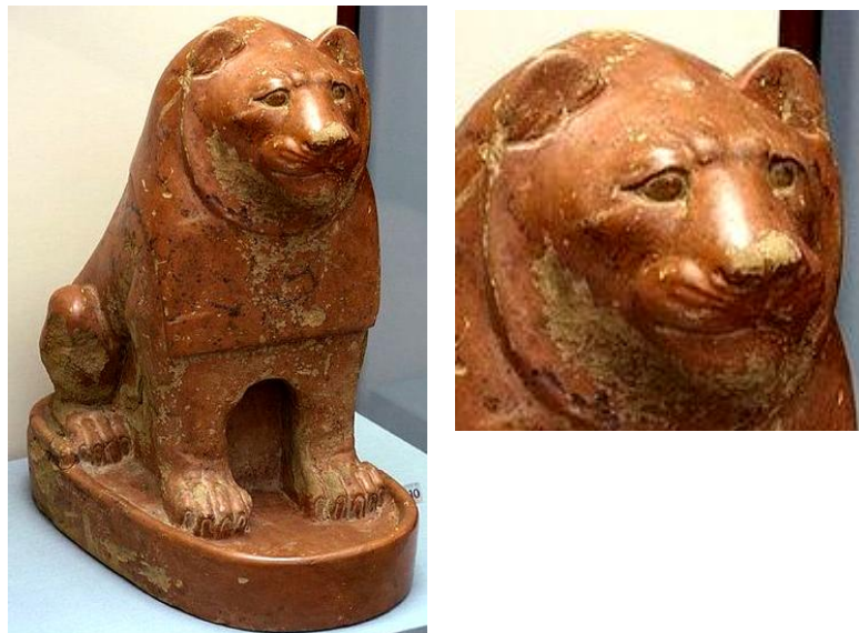
Figure17. Pottery lion from Naqada III [29].