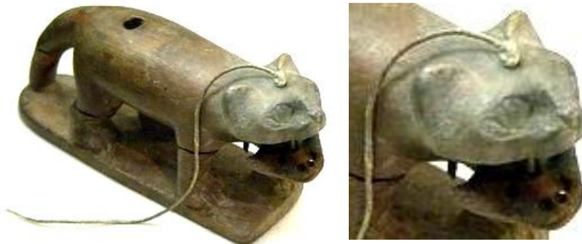
Figure3. Wooden toy cat from the New Kingdom [17].