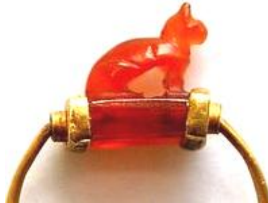
Figure5. Carnelian cat figurine from the 3 rd Intermediate Period [17].