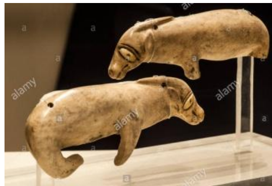
Figure11. Ivory dogs from Naqada I/Naqada II [23].