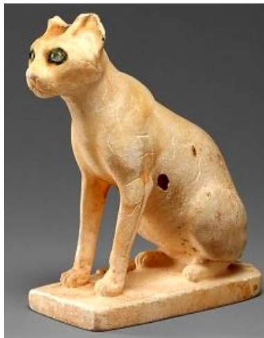
Figure1. Cosmetic jar in the shape of a cat from the 12 th Dynasty [15].