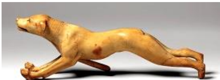
Figure15. Ivory hunting dog from the 18 th Dynasty [27].