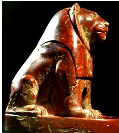
Figure20. Setting lion from the 6 th Dynastic [33].