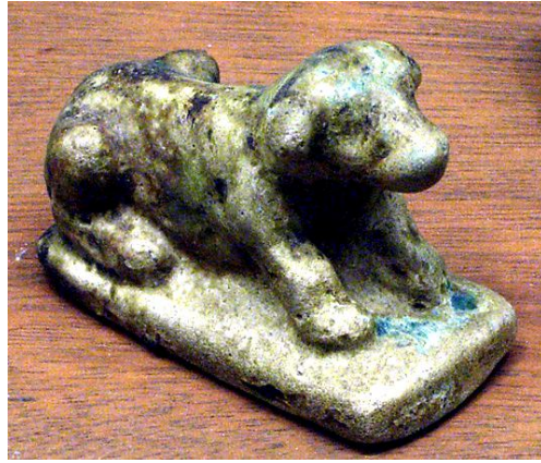
Figure13. Faience dog from the 12 th Dynasty [25].