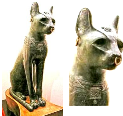
Figure8. Casted bronze cat from Late Period [17].