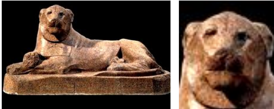
Figure22. Granite lion from the 18 th Dynasty [35].