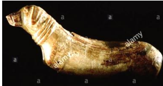
Figure10. Ivory dog from Naqada I [22].