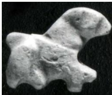
Figure12. Ivory dog from the 11 th Dynasty [24].