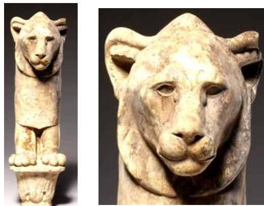
Figure24. Wooden lion as a furniture leg from the Late Period [36].