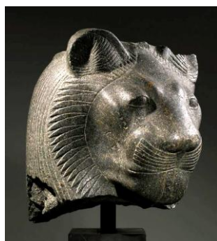
Figure21. Diorite lion head from the 18 th Dynastic [34].