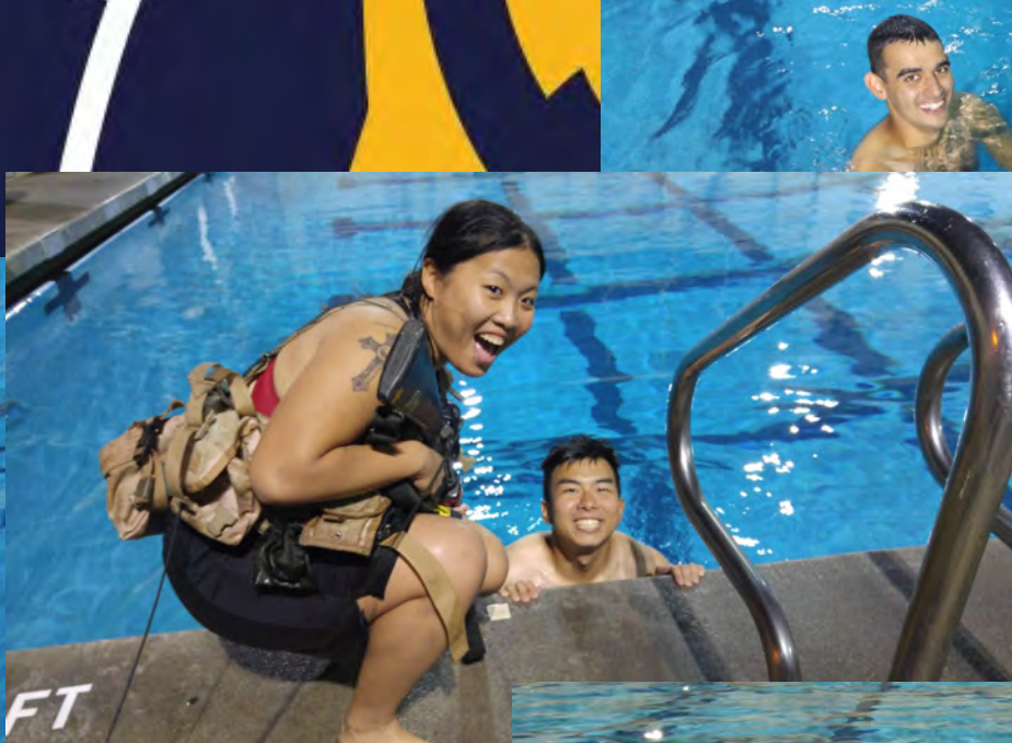
To the right: Cadets are doing the 10 minute swim and 5 minute tread event.