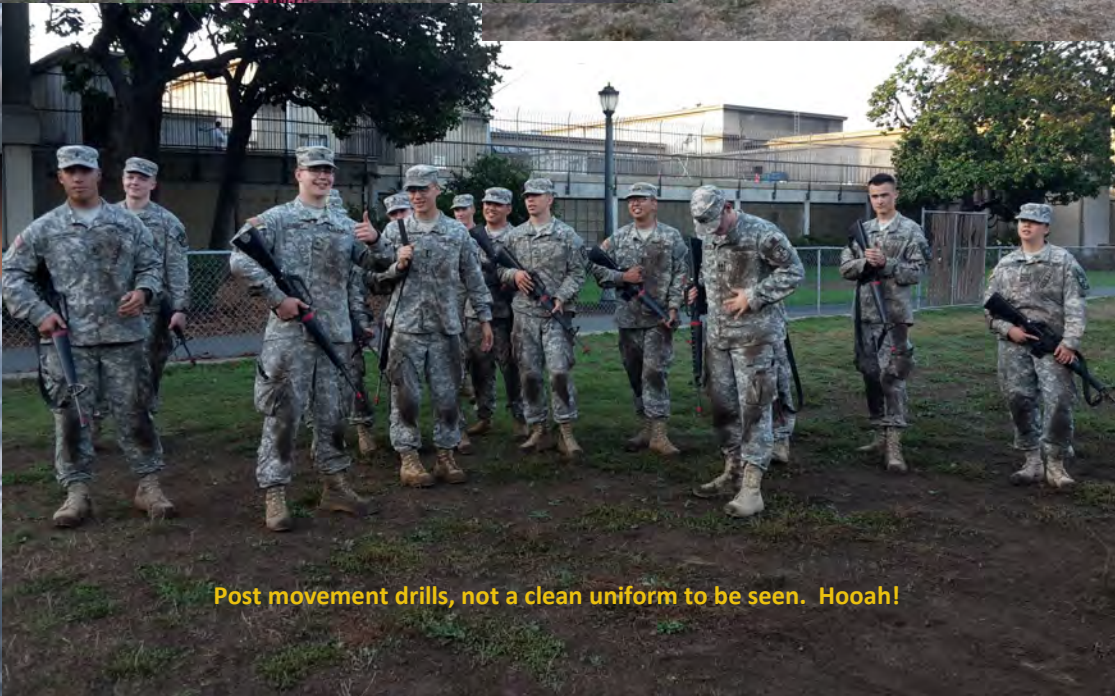
Post movement drills, not a clean uniform to be seen. Hooah!