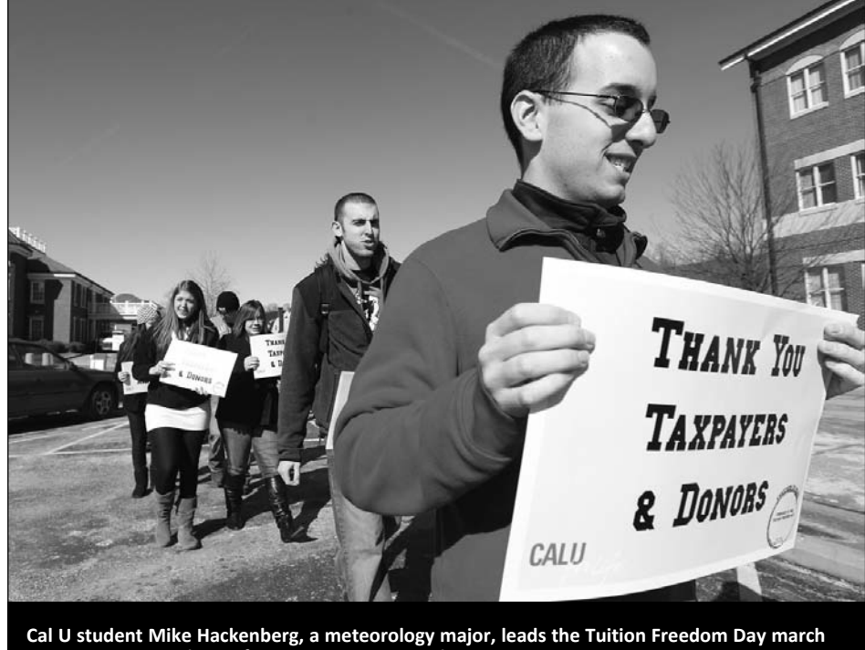
across campus to the Performance Center on Feb. 15.