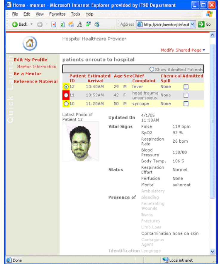
Figure 3: Web portal for emergency room personnel