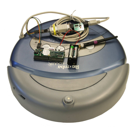
Figure 3: iRobot Roomba vacuum cleaner robot attached to a Gumstix computer.

One can define two general categories of robots, prebuilt and do-it-yourself (DIY). Pre-built robots are generally found in research labs, industry, and the military. All of these places have significant funds with which to purchase such fully constructed robots, which can cost upwards of 3,000.00 USD, a price point considered beyond the reach of most users.