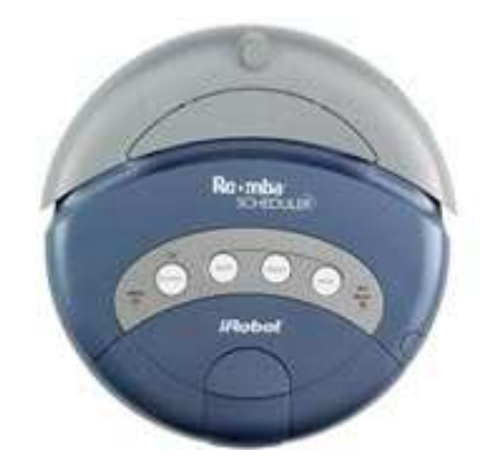
Figure 1: iRobot Roomba vacuum cleaner robot.

In the remainder of this paper we briefly outline the Roomba/Create robot programming testbed that is at the heart of the robot programming resource we have developed.