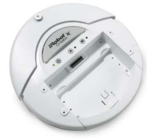
Figure 2: iRobot Create programmable robot.