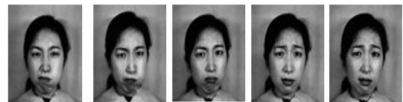
Figure 4: Samples of JAFPE database

(iii) Japanese Female Facial Expression (JAFPE) [9] ace database consists of seventy images of size 256 x 256 from ten persons with seven images for each person. The images were taken in seven different emotional facial expressions. Out of ten subjects present eight were considered for gallery. Figure 4 shows the samples of JAFPE face images of a person with different poses.