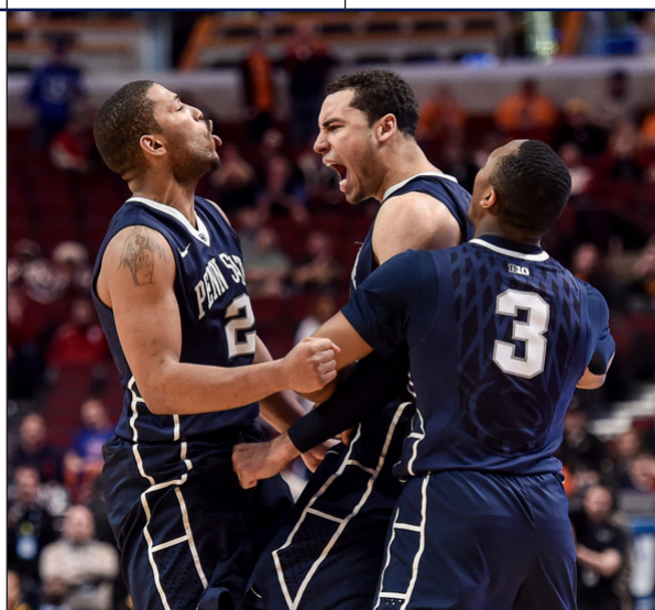
Penn State advanced to the quarterfinals last season as the No. 13 seed, winning its first tournament games since 2011.

LAST 10 MEETINGS: 1-8 L, 66-60 @ PSU, 1/21/16 L, 47-55 @ PSU, 2/18/15 L, 72-89 @ WISC, 12/31/14 L, 66-71 @ PSU, 3/2/14 L, 60-63 @ PSU, 3/10/13 L, 51-60 @ WISC, 1/3/13 L, 55-65 @ WISC, 2/19/12 L, 46-52 @ PSU, 1/31/12 W, 36-33 @ Big Ten Tour., 3/11/11 L, 66-76 @ WISC, 2/20/11