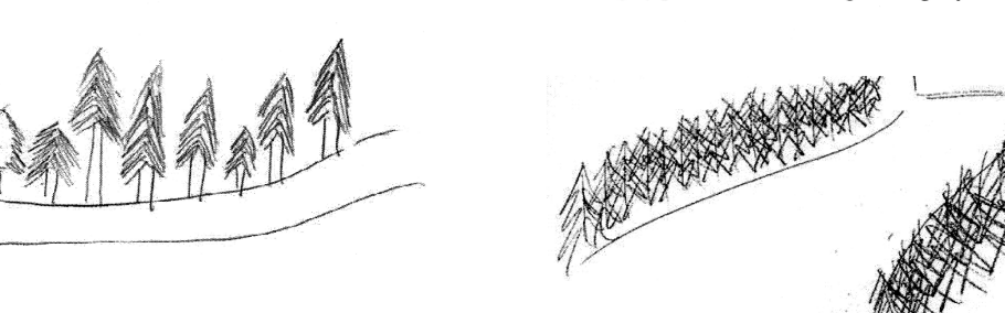
Over eighty pine trees run along the edge of the driveway