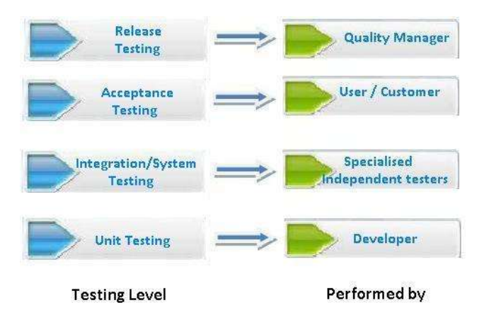
Figure 2: Software Testing Levels.

Different purposes are addressed at the different levels of testing. Factors which decide who will perform testing include the size and context of the system, the risks, the development methodology used, the skill and experience of the developers. Testing of individual program components is usually the responsibility of the component developer (except sometimes for critical systems); Tests at this level are derived from the developer's experience. Testing at system/sub-system level should be performed by the independent persons/team. Tests at this level are based on a system specification [6]. Development staff shall be available to assist testers. Acceptance Testing is usually performed by end user or customer. Release Testing is performed by Quality Manager. Figure 2 shows persons involved at different levels of software testing.