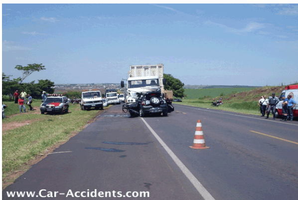
Fig.-4: Road side Collision

The main result for this paper is to avoid the avoidance of collision between the road side vehicles.