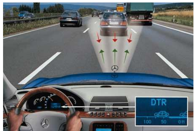
Fig.-2: Front side image collision

Secondly we had given the example for front and back side image collision