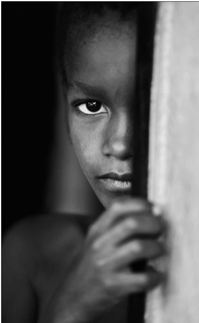
Cal U will take an in-depth look at the tragic events that recently took place in Haiti with a special convocation beginning at 11 a.m. Thursday in Steele Hall.

All members of the Cal U community are invited to the special convocation. The gathering is scheduled for the common hour so that all interested students and faculty may attend.