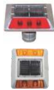
Solar Road Stud