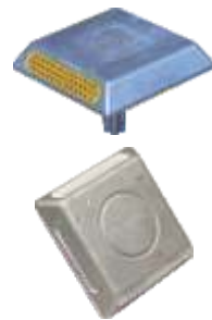
Aluminum Road Stud