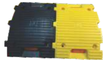
ABS Speed Breaker