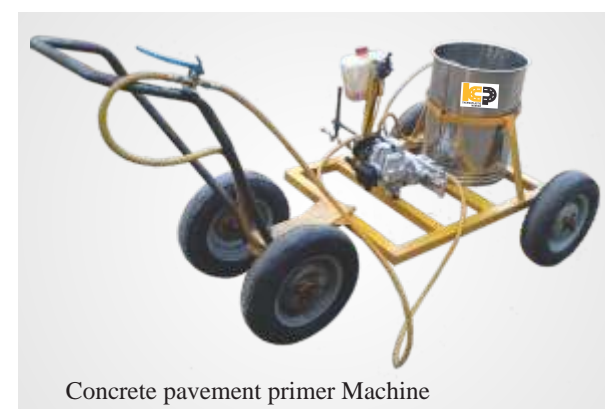
Concrete pavement primer Machine