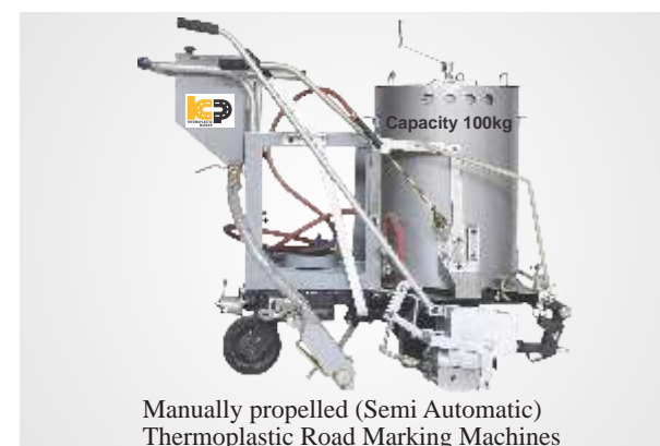
Manually propelled (Semi Automatic) Thermoplastic Road Marking Machines