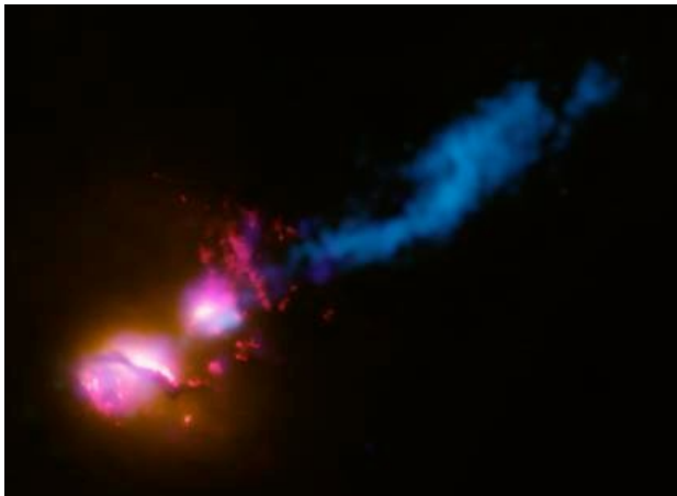
Figure 1. "Death Star Galaxy" (3C321), Credit: X-ray: NASA/CXC/CfA/D.Evans et al.; Optical/UV: NASA/STScI; Radio: NSF/VLA/CfA/D.Evans et al.,STFC/JBO

1. There is a brightly lit, massive gash in the larger galaxy. (Implying a recent pass-through by the smaller galaxy.)