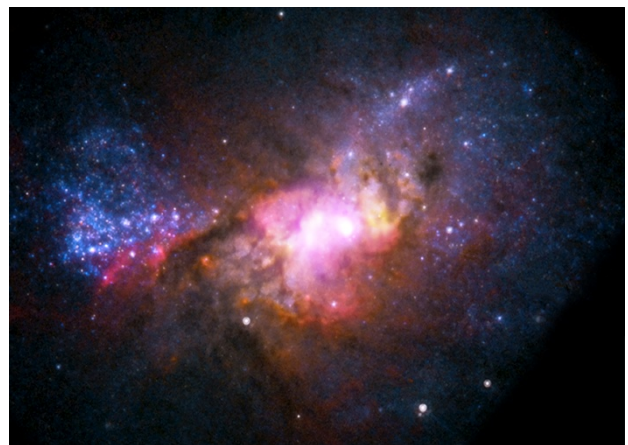
Figure 2. Henize 2-10, Credit: X-ray (NASA/CXC/Virginia/A.Reines et al); Radio (NRAO/AUI/NSF); Optical (NASA/STScI)

Compact dwarf (CD) galaxies, such as Henize 2-10 (Figure 2.), provide additional support of a BH/BH rejection mechanism. These galaxies rotate about vastly over sized central SMBH, and appear as jumbled collections of stars without normal galactic disks. Their small size and jumbled appearance suggests violent stripping of their primordial galaxies. A rejecting and course-altering collision with a larger SMBH would produce these effects. Significant SMBH course change would free the stars of the primordial galaxy to continue on their original course and eventually join the larger SMBH's galaxy. The smaller SMBH would leave the collision with only the primordial stars that it could turn from their original course and whatever new stars it could capture from its larger collision partner's galaxy. Regardless of their origin, these stars are unlikely to orbit neatly in their former galactic plane.