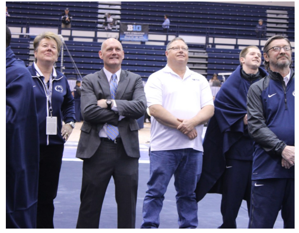
Watching the growing up video presentation always brings smiles and sometimes tears