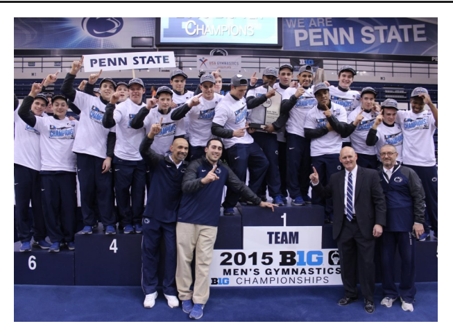
A happy Penn State team dons their Big-10 Championship t-shirts and celebrates their victory in front of wild home crowd in Rec Hall