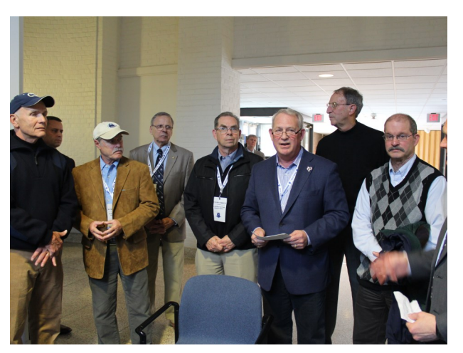
Some of the key people who spearheaded the Wettstone Initiative at dedication ceremonies in White Hall during the Big-10 Championships