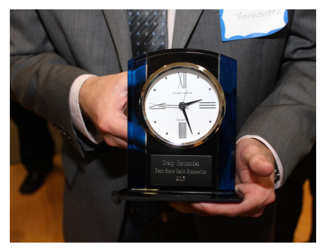
The senior gift our Men's Gymnastics Club presented to our 5 seniors