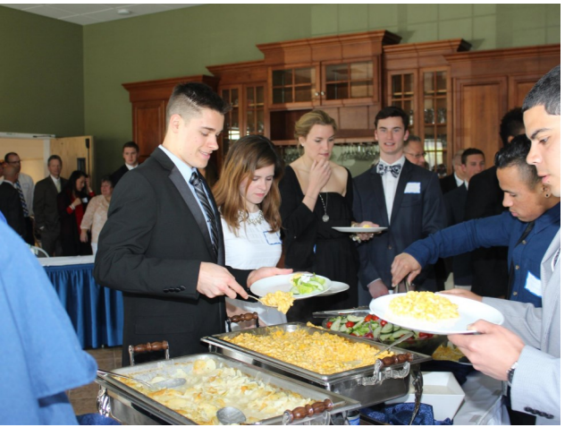
The banquet food line at Celebration Hall