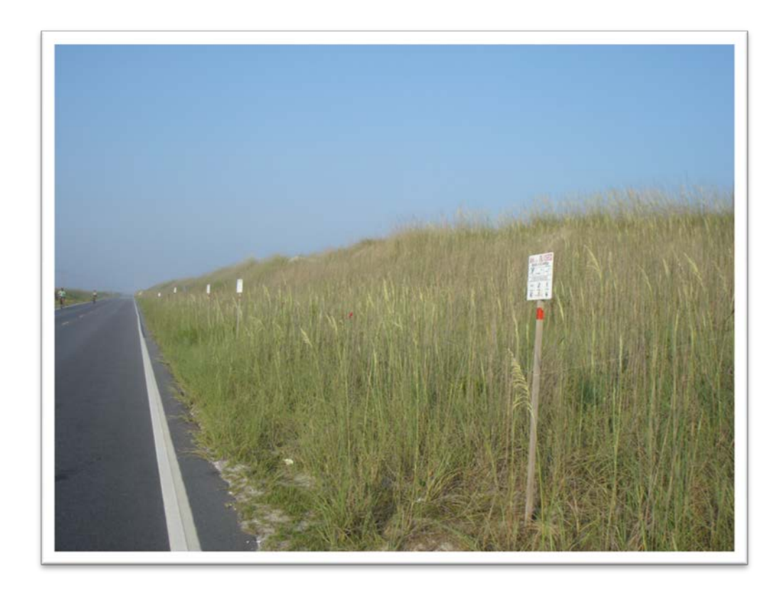
Figure 5: Along Highway 12 lie the artificial dunes that make possible both the recreational area and its associated conflicts.

alike. Since then, the Access Issue has come to condense a series of tensions surrounding natural resource management on Hatteras. NPS personnel find themselves managing a constantly-changing seashore via bureaucratic procedures that take years to put in place and may or may not be permanent. These officials admit to ecological uncertainty in official reports by noting a range of locations for shifting sand spits and acknowledging the variable effects hurricanes and nor'easters have on nesting bird and turtle populations.