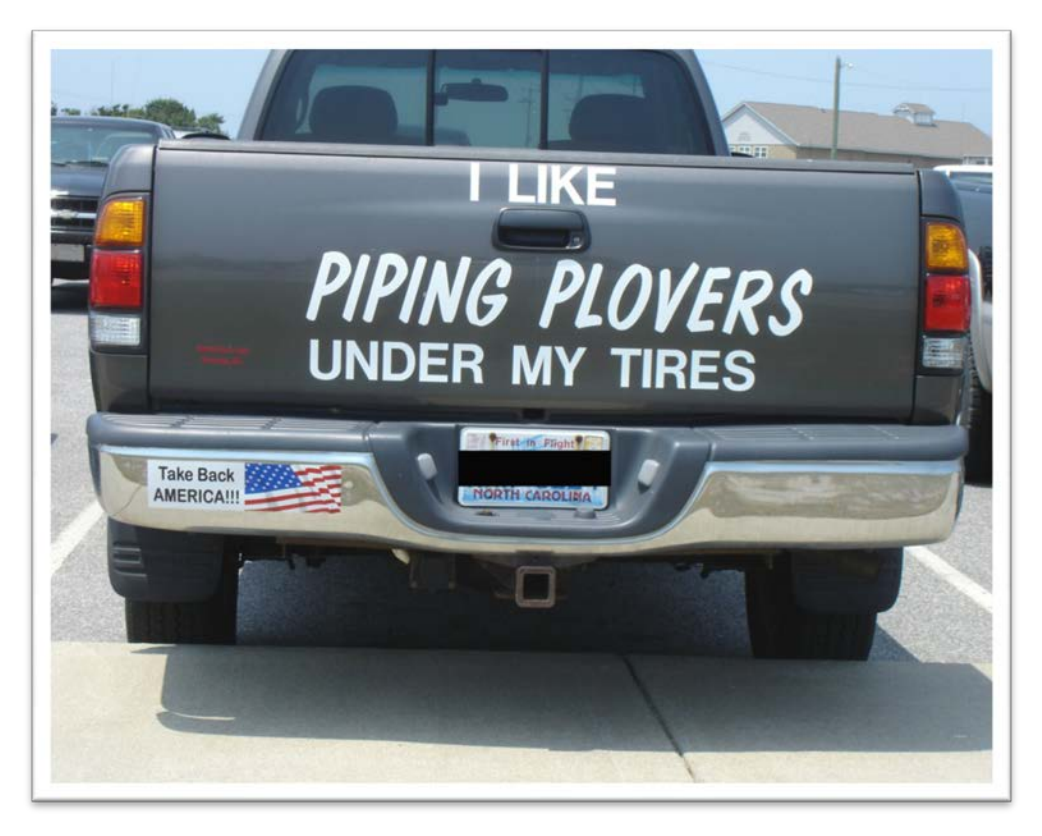
Figure 3: Intimidation campaign or protest movement?