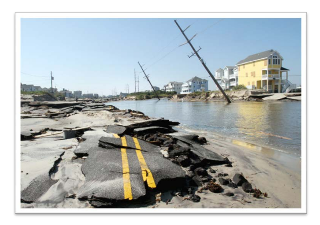
Figure 4: Damage to Highway 12 following Hurricane Irene in 2011.

These artificial dunes lie at the center of the Access Issue today (See Figure 5). The dunes inhibit the natural over-wash where shorebirds nest, leaving only the spits (the areas where the ocean over-wash creates an expanse of open beach) around inlets for bird habitat. To complicate matters, the spits created by the dunes also proved to be the best surf fishing areas and are easily accessed in a vehicle. On a summer weekend, a CAHA spit might be lined with cars and trucks.