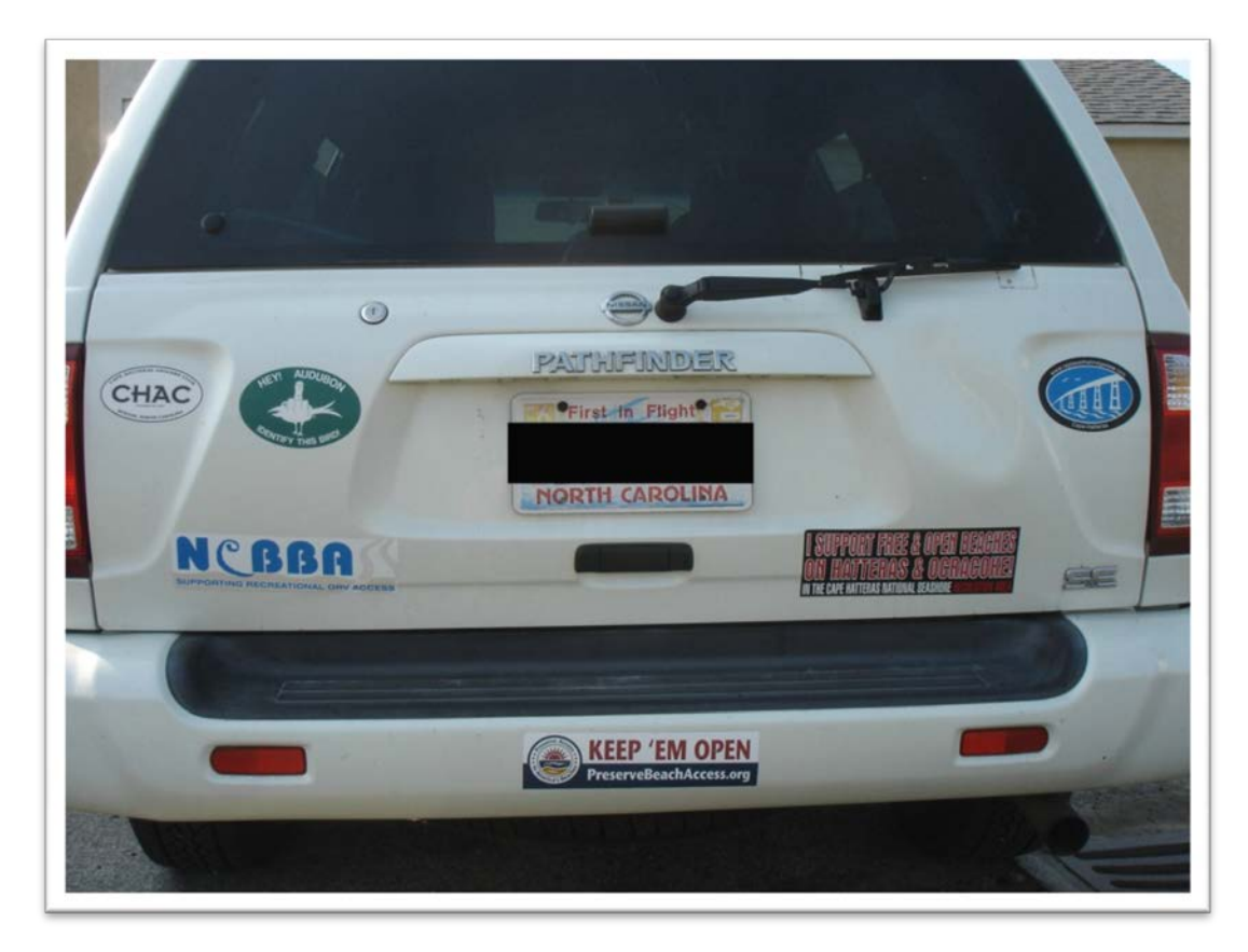
Figure 2: Pro-Access humper stickers: "I support free and open beaches on Hatteras & Ocracoke!" "Hey Audubon, Identify this Bird!"

North Carolina example might be unusual in that local residents participating in the co-management process were accustomed to having as much, if not more, political clout than conservation officials.