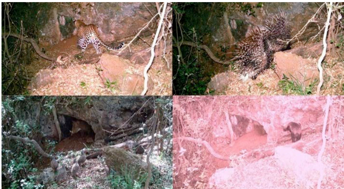
Plate 3. Examples of leopard, porcupine, warthog and honey badger at Upper Tufa Cave