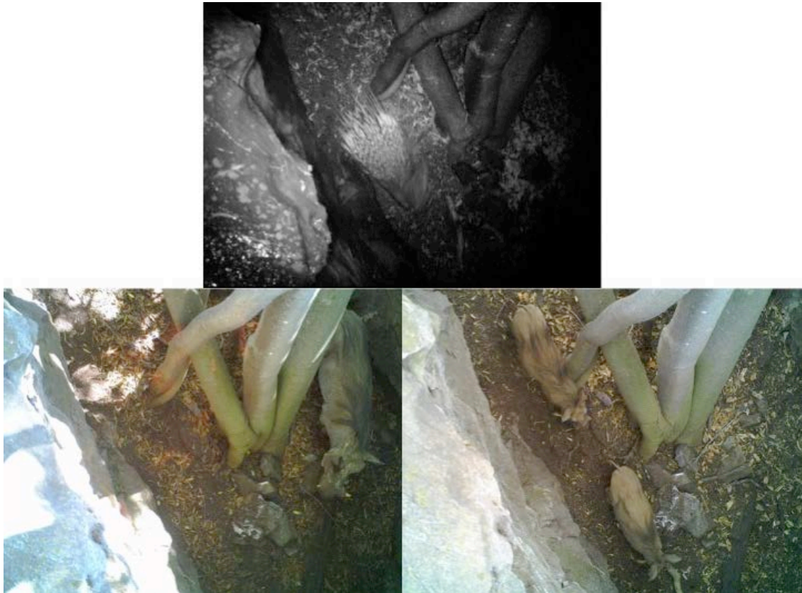
Plate 2. Examples of warthog and porcupine entering Porcupine Cave

a smaller entrance. These two caves were formed in dolomite, by a karst system that is part of the Transvaal Supergroup [27], and have a different type of geology to the tufa caves. The next two caves are formed within the same tufa formation on the Malapa Nature Reserve and are referred to as the Upper Tufa Cave and the Lower Tufa Cave. The Upper Tufa Cave is the most active cave with at least seven different animals seen at the entrance including: leopard, warthog, porcupine, Chacma baboon, vervet monkey, honey badger and kudu (See Plate 3). The Lower Tufa Cave is the least active with only three animals seen at the cave: kudu, sable, and warthog.