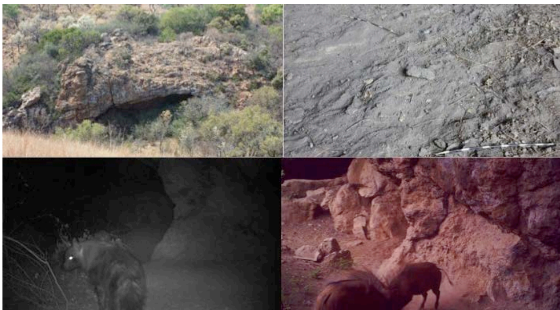
Plate 1. Uitkomst Cave with evidence of porcupine as well as brown hyaena and warthog in the cave

Twelve motion sensor trail cameras (either Moultrie ® , Bushnell ® or Lynx Optics ® ) were set up at varying locations on the nature reserves and were checked at 20-30 day intervals. The motion sensor was set to take three time-lapsed photos when movement is detected. With this we were able to monitor the various caves and subsequent usage with minimal disturbance to the wildlife. The cameras have been placed taking into account locations suggested by individuals who work at the reserve and have seen particular animals, as well as by tracking spoor when possible. Most locations were chosen from witness reports as the geology at the nature reserves makes the terrain difficult for tracking spoor. Photos were time and date stamped, as well as recorded ambient temperatures.