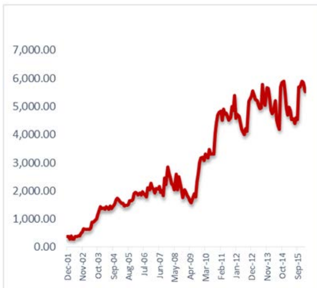
Figure 1. FReserve($mill.)

The graphs below depict that, for the period under study, both foreign reserves and market capitalization recorded a momentous growth as shown in Figure 1 and Figure 2 respectively. The Government of Ghana through the Ghana Stock Exchange in recent years has introduced copious policies and measures geared towards the growth in the country's stock market as well as a boost in foreign exchange reserves. Hence to fully understand the impact