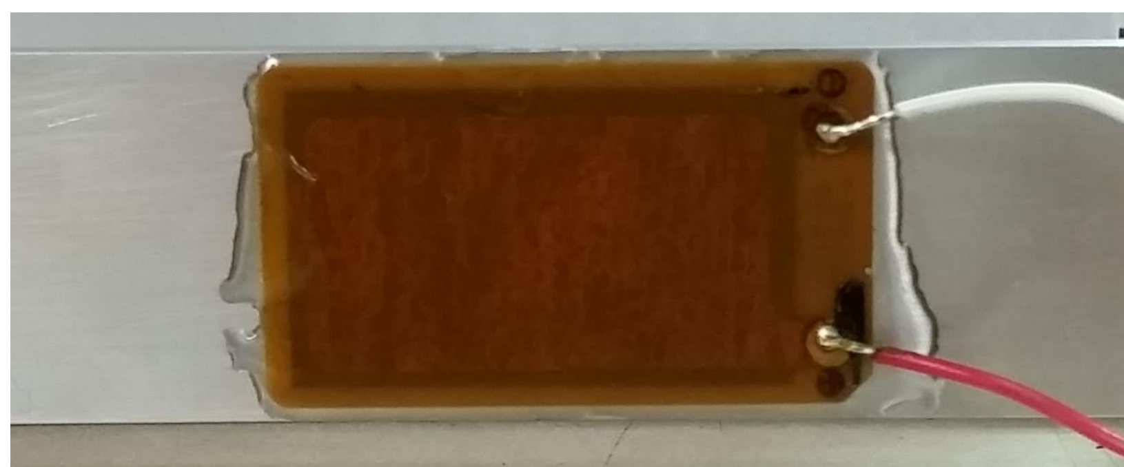
Fig 1. Piezoelectric actuator bonded to an Aluminum beam.

Consequently, utilizing a piezoelectric actuator to produce a bending moment in order to oppose an external load on a member could potentially lead to a reduction in the stress experienced by the member. However in order to reduce stress, the piezoelectric device must possess the capability of producing a large amount of force.