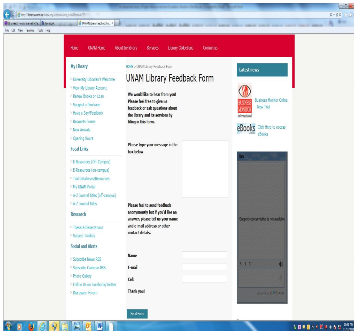
Figure 3: Web library feedback form and chat box

Library feedback form (see Figure 3 below): The UNAM library endeavoured to hear from its users using this platform. The library users could give feedback or ask questions about the library and its services by filling in a web form. Users could submit the form anonymously, but they needed to provide their names and e-mail addresses if they wished to receive an answer from the library.