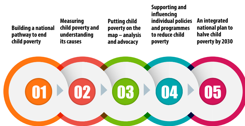
FIGURE 1.1: Possible milestones and activities towards halving child poverty being part of a national poverty reduction plan.