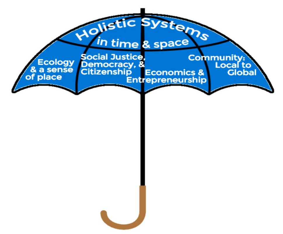
Figure 3: Thematic Construct for Sustainability Curriculum

The first theme, 'Holistic Systems in Time & Space' could easily be articulated as the primary umbrella [See Fig. 4] under which the other four are understood and applied in personal, professional, and civic life.