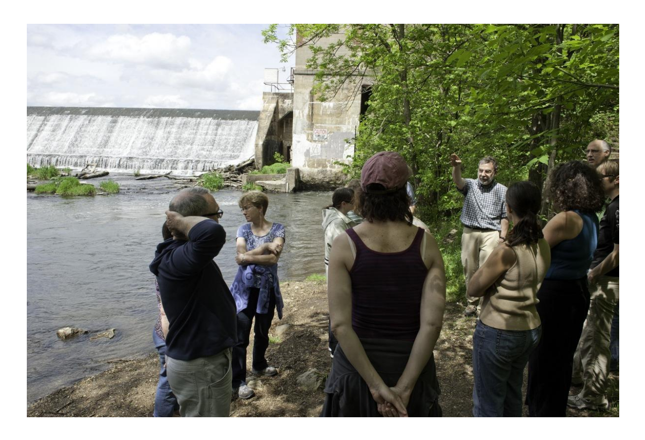
Figure 2: Meditation on Place activity along the Kinnickinnic River

The Kinnickinnic Project, now in its fifth successful year, provides community for faculty members; deepens awareness of the ways in which sustainability can be integrated into all academic disciplines; and fosters intellectually stimulating dialogue around local, national, and global sustainability issues among our colleagues and students. Our project underscores the view that community, awareness, and dialogue are vital catalysts to precipitate economic, environmental, and social action in support of a prosperous and sustainable world.