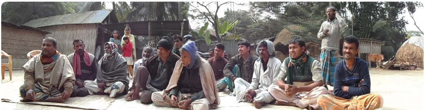
Farmers engaged in a BIF project in Bangladesh

From the BIF experience we discern a link between partnership and innovation. As we have noted, large companies are very good at a limited number of things. They are also good at innovating within areas where they otherwise strong. However many of the partnerships that they form are about innovating in the aspects of the market creation that they are not good at. Some aspects of collaboration are around 'borrowing' a strength from a partner, such as the credibility that stems from having submitted to scrutiny from an academic institution, but partnering become particularly valuable when the combined knowledge and resources of organisations with very different outlooks and experiences is combined in a way that creates something that is new to both.