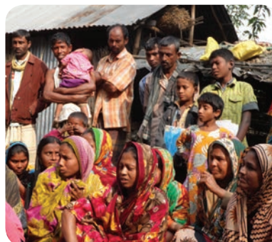
Farmers discuss a BIF project in Bangladesh

However all of the 15 large companies asked BIF to help them with some kind of collaboration and 11 of the 15 cited 'partnership' or 'collaboration' as being a significant element of the innovation that they foresaw in the inclusive business project that they were asking BIF to support.