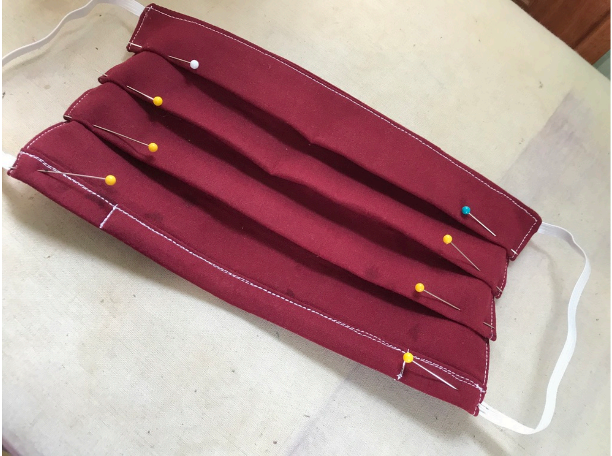
Photo #14 Tuck elastic ends into wire casing ends, pin pleats (Not pictured - optional cloth ties – take the unattached remaining 2 ties and insert each one into the wire casing ends.)