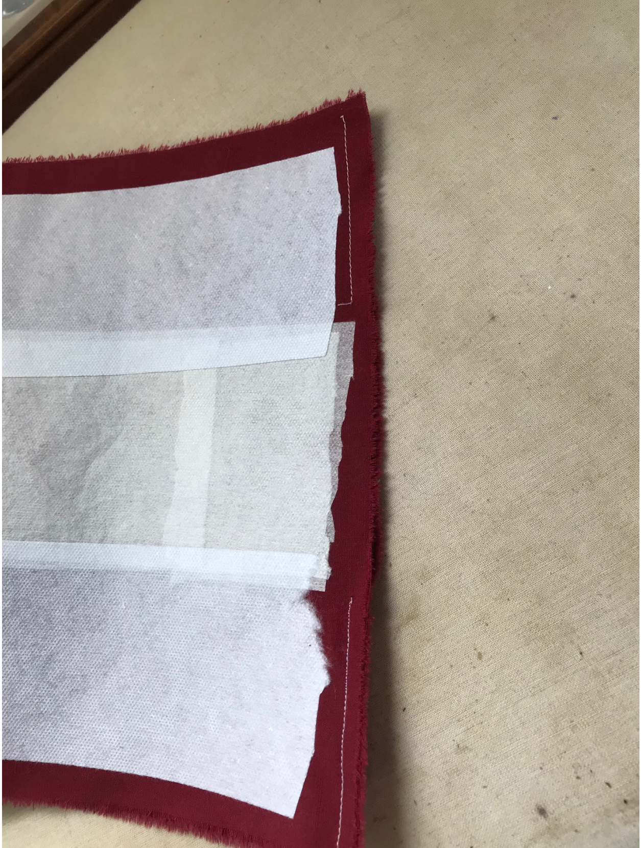
Photo #4: 9 1/2" Side is stitched with center left unstitched to turn later