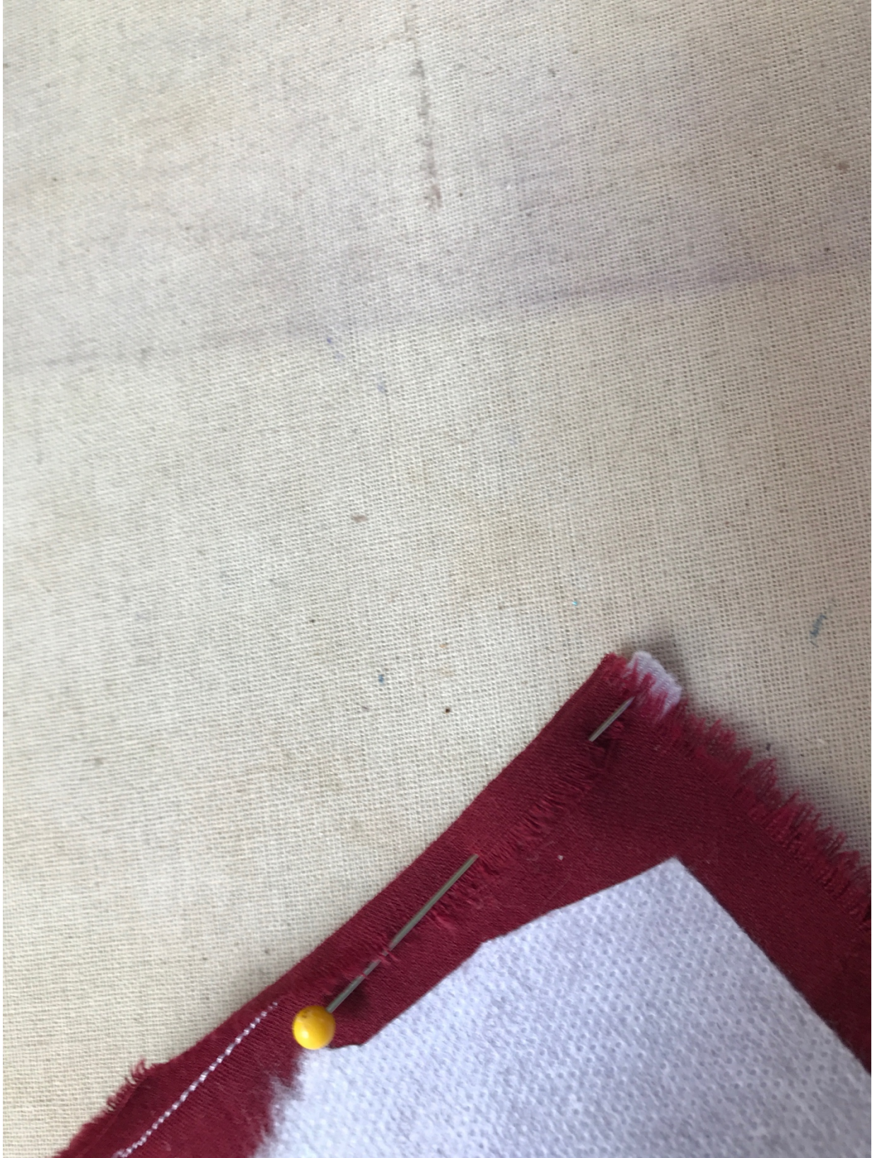
Photo #5: Placement of elastic in both sides of this seam (Not pictured – cloth ties can be substituted for the elastic.)