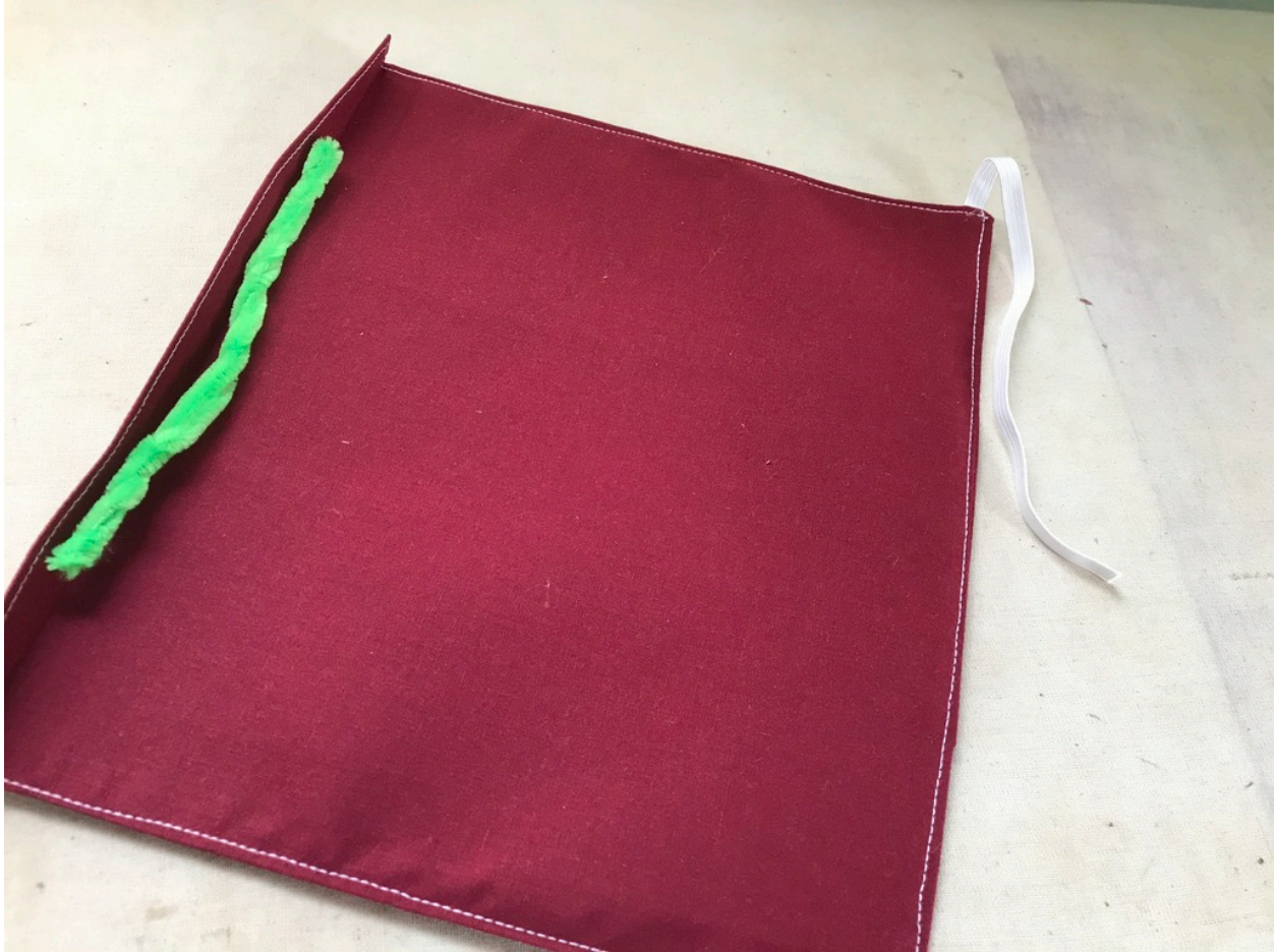
Photo #9 Folded edge pressed \frac{1}{2} " then center wire along fold