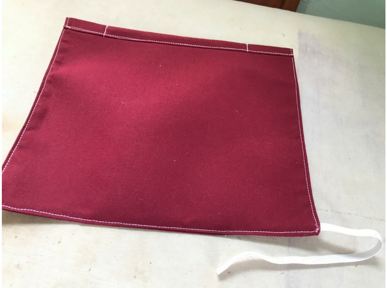
Photo #11 Wire stitched within casing then stitched next to ends of wire so can't shift