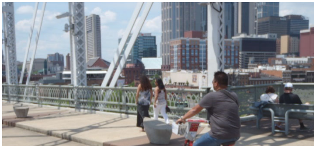
Once designed for motor vehicles, the John Seigenthaler Bridge in Nashville was converted to bicycle and pedestrian use only in 1998. Here, a cyclist utilizing Nashville’s bicycle share system crosses the bridge.

Ideally, sustained efforts can evolve so that each party gains an understanding of one another’s strengths. This can afford opportunities for entities to leverage one another’s expertise to ensure that resources are used as efficiently as possible. For example, public health practitioners may be more experienced at developing health metrics and evaluation