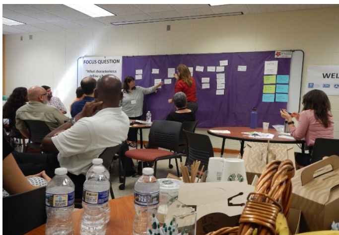
Stakeholders support development of the Transportation and Health Tool (THT) at a workshop in Greensboro, North Carolina. More information about the THT is available in the case study on page 35.

Other emerging issues may provide additional opportunities for collaboration, including climate change, greenhouse gas analysis, and disruptive technologies (including shared ride services, automated vehicles, and connected vehicles). While this guide does not go into detail regarding such issues, a strong foundation for communication between transportation and public health practitioners should enable them to carry the dialogue forward into addressing new and emerging topics.