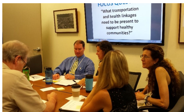
Stakeholders provide input into the development of the THT at a workshop hosted by Delaware Department of Transportation.

As discussed in Section 2, other topics for which transportation and health interrelate include noise, stress, mental health, social infrastructure, and overall well-being, which may apply to a particular initiative or collaboration. A host of unique questions may apply across these topics with transportation practitioners generally focused on socioeconomic impacts to communities and health practitioners focused on physical, social and emotional health outcomes.