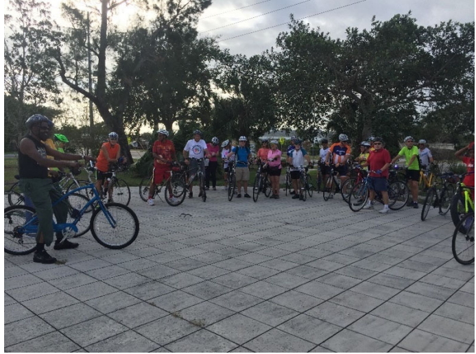
Wabasso residents and stakeholders take a physical assessment of accessibility and connectivity for bicycles in their community.

tailored messages to targeted audiences to encourage individuals and groups to make choices that have been demonstrated to improve health.