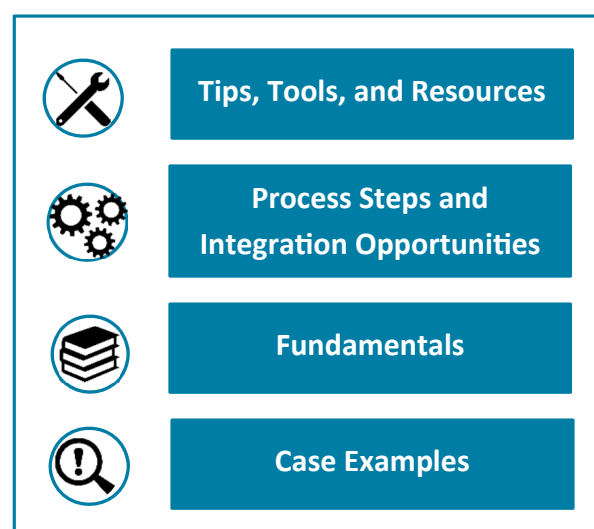
Figure 1-1: Icons Used in the Guidebook

The colors shown in Figure 1-2 are used throughout each section of the guidebook to remind the reader to which step in the transportation and health communication framework the information relates. To provide further guidance within each step, the key questions identified in Figure 1-2 for each step are presented in call-out boxes within each section along with information and resources that help answer those questions and move through the corresponding step in the process.