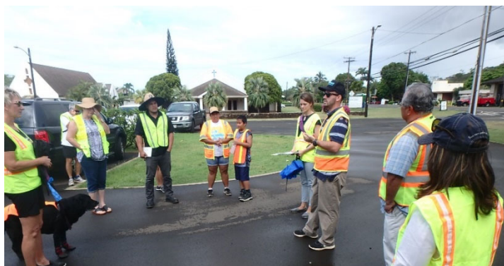
Walk audit facilitators and participants converse in Kauai County. For more information on Kauai County Transportation and Health efforts, see the case example on page 48.

What techniques are most effective for communication and collaboration?