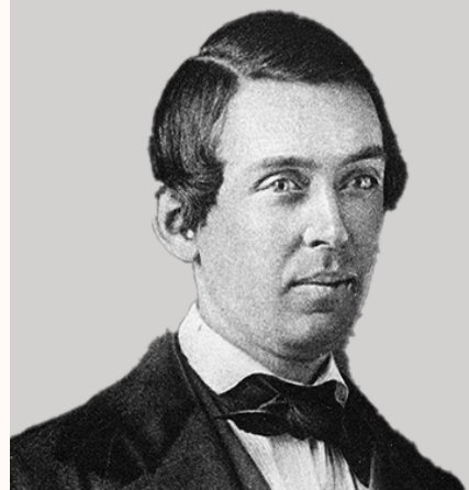
E.R. Squibb and Sons -1921