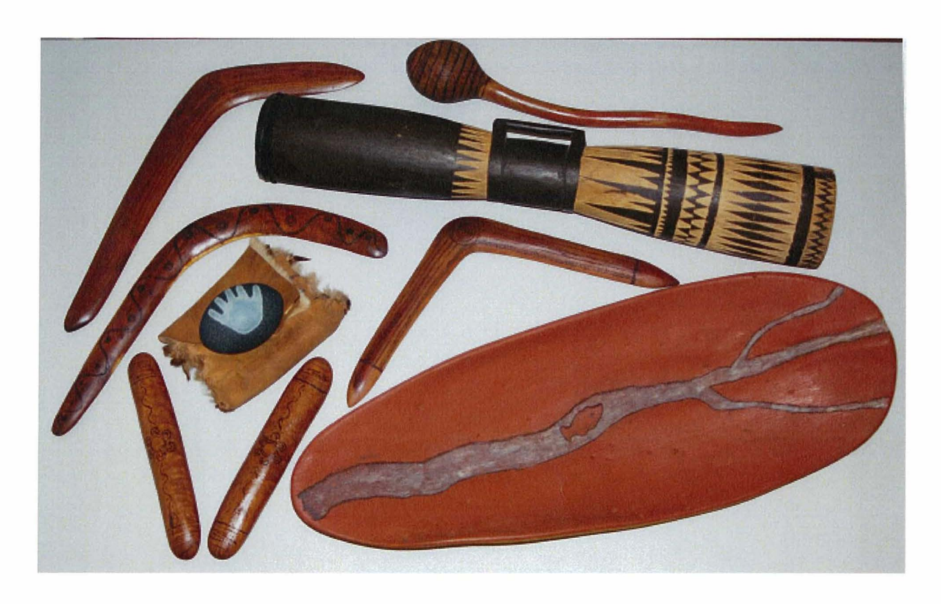
Figure 3: Not Just 'Artefacts', but Eight Tools for Learning

souvenirs of culture we must put forward our deep knowledges to set the standard and demand quality from the best that mainstream learning has to offer. Remember that at low levels of knowledge there is only difference across cultures, but at high levels there is common ground. Every one of the eight ways of learning shown in this paper is present in western and other cultures as well as our own. Our higher order thinking processes need to be revealed in cultural items that are currently seen as primitive, simple or exotic. Bring the deep knowledges from different cultures alongside each other and find that common ground for a true act of reconciliation.