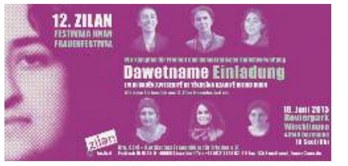
Invitation to the "Zilan Women's Festival"

Such activities undertaken by PKK violate German law and, what is more, damage the relations Germany has with other countries!