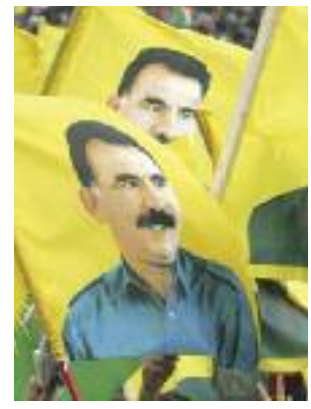
Kurdish New Year's Festival "Newroz"

Similar to the Islamists' strategies, Kurdish extremists offer assistance to refugees, referring them to Kurdish associations in Germany, where social contact can be established. The assistance offered ranges from donations of food and clothes to support provided when dealing with the authorities.