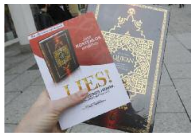
Salafists distributing copies of the Koran

language courses as well as interpreter services offered in dealing with German authorities.