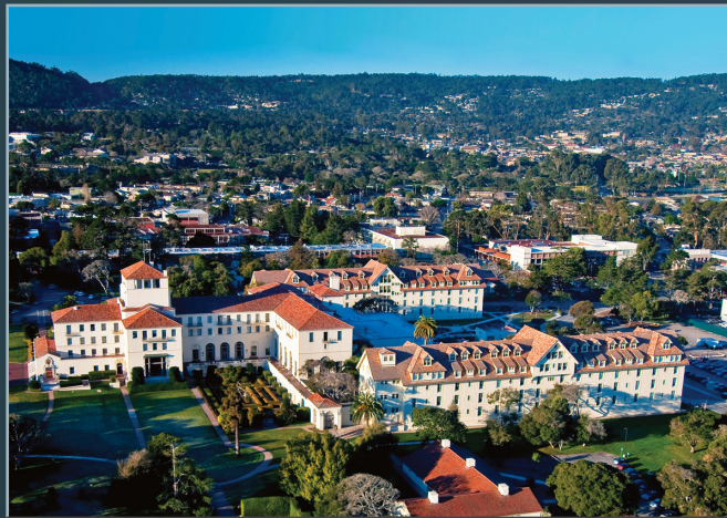
Herrmann Hall, NPS Campus, Monterey, CA