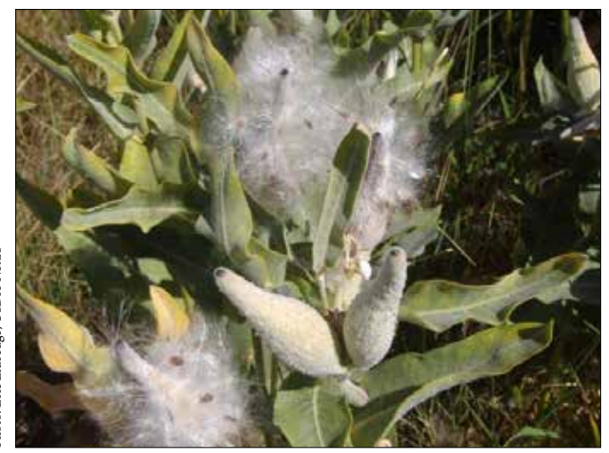
<u>Showy milkweed (Asclepias speciosa)</u>: This species' fruits have a woolly texture and sometimes have warty projections.