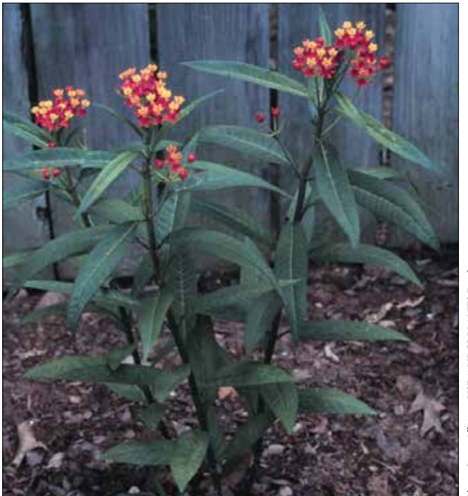
Larry Allain @ USDA-NRCS PLANTS Database