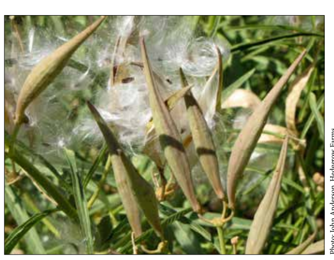
<u>Narrow-leaved milkweed (Asclepias fascicularis)</u>: This species' fruits are hairless and have an elongated, tapered shape.