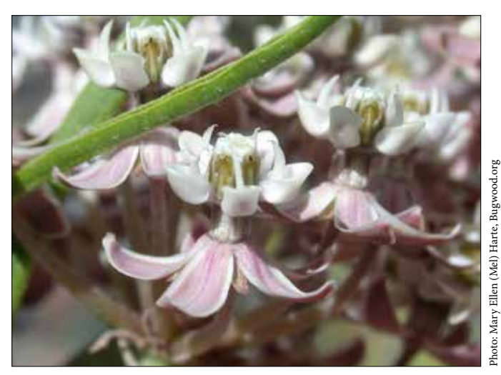
<u>Narrow-leaved milkweed (Asclepias fascicularis)</u>: The corona is white and the corolla is pink.

Milkweeds are named for their milky, latex sap, which oozes from the stems and leaves when plants are injured. Milkweeds are not the only plants that have milky sap, but in combination with the unique flower shape, this can help to positively identify a milkweed plant. To check for the sap, tear off a small piece of leaf to see if it oozes from the torn area. Avoid any contact of the sap with your skin, eyes, or mouth.