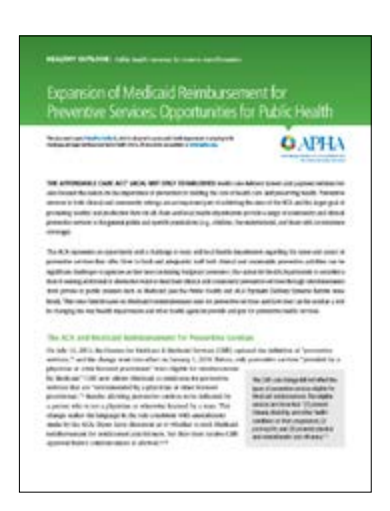
click to view

This issue brief explains what community preventive services are, identifies tools and resources that can be used to support community prevention at the state and local levels, and explains the important role of health departments in providing these services.