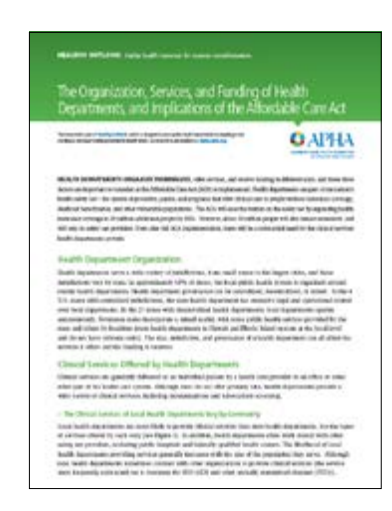
click to view

The Summary Table includes short descriptions of the operation, participants, funding, and duration of the ACA's delivery and payment reforms.