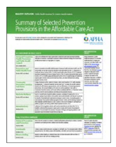
click to view