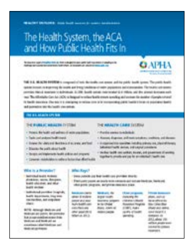
click to view

There are many reasons why health reform is necessary. Why We Need the ACA describes the health law's focus on increasing prevention and health insurance coverage as the first steps in reducing health disparities and unsustainable health care spending.