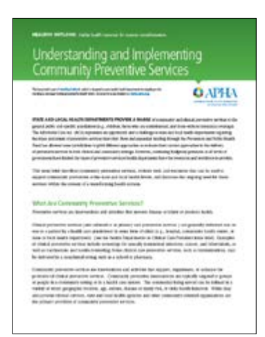
click to view

The ACA bolsters prevention by supporting public health programs and research, establishing public education campaigns, and increasing the number of preventive services offered without cost-sharing. This table describes these prevention efforts and how they have been implemented.