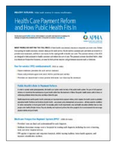
click to view

This fact sheet provides an overview of the health system. It explains how public health and the health care system together make up the health system. It also defines the role of "provider" and "payer" and highlights the importance of public health's engagement in ACA implementation.