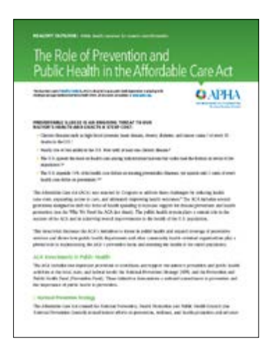
click to view

This issue brief describes the organization and funding of health departments and how these two factors affect the services health departments offer. The issue brief also examines ways the ACA is changing the way health departments receive funding and offer services.