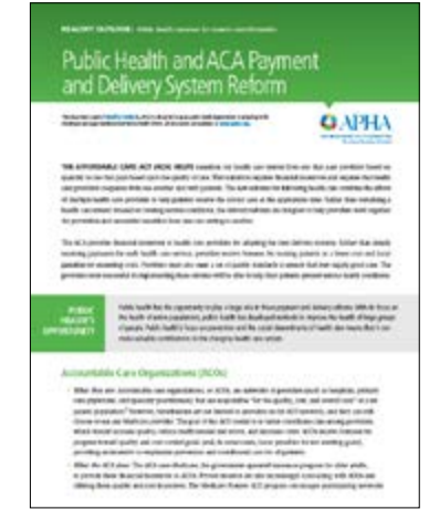
click to view

Health Care Payment Reform details the different health care payment systems and how they are changing in response to the ACA. It also explains how the public health system and Medicare are taking part in payment reform.