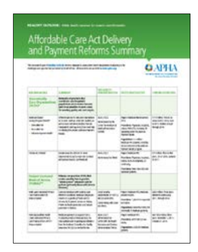
click to view