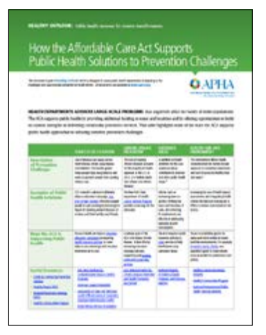
click to view

The ACA makes many investments in public health and preventive services. This issue brief demonstrates the central role of prevention in ACA implementation. It also shows the important role public health departments play in implementing the ACA's prevention initiatives.