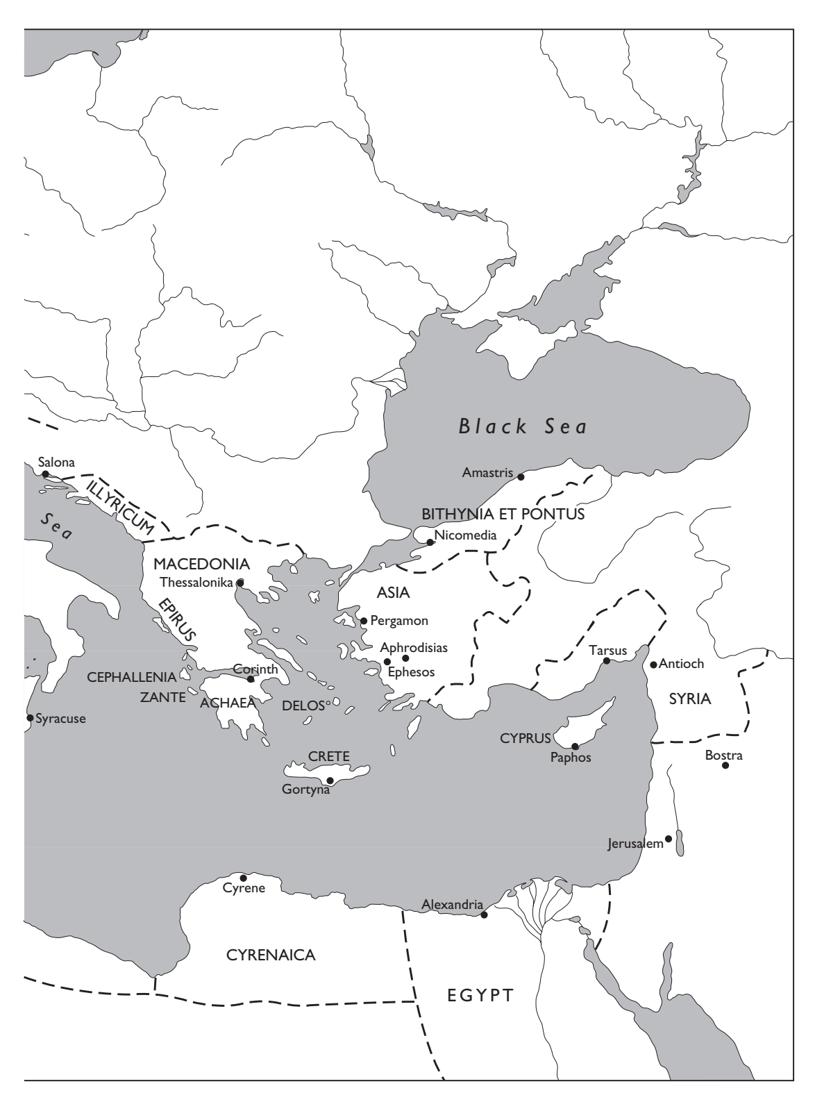
Map 7.1. (cont.).